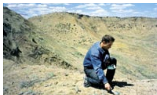
Measuring radiation close to “ground zero”

a number of activities in 2004, many of which are still in progress.