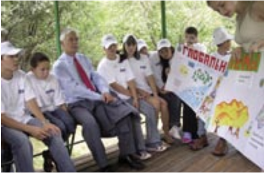
Ambassador Vikki joins the group for a special presentation.

On the train, all along the way to the summer camp in Almaty, we were throwing beverage bottles and all kinds of litter out the window. On our way home, we found ourselves collecting our rubbish in a big plastic bag and handing it over to the cleaning woman. And whenever we spotted fellow passengers and wagon conductors thoughtlessly tossing refuse out the window, we went out of our way to explain to them how they were ruining their environment by their actions.