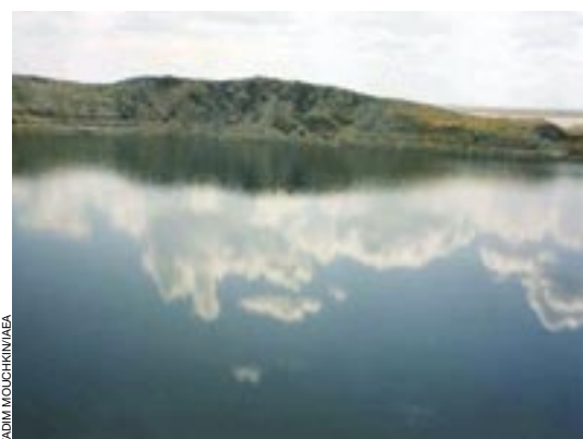
“Atomic lakes” created by nuclear explosions