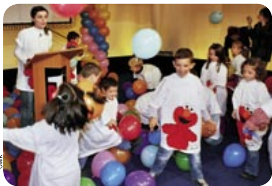
Fun and games at the Kosovo launch

This time, the Dragash/Dragaš Community Centre that was established by the OSCE in January 2003 was assigned the task of taking Ulica Sezam — Sesame Street in Serbian — to several villages under a "mobile cinema" scheme.