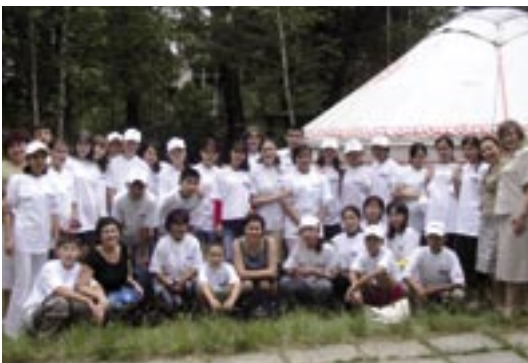
Teens and trainers record a life-changing experience.

We celebrate Ecology Week every year in December, but this time, I think it will be especially challenging because I — now the holder of a "Consultant on Environmental Protection" certificate — will be responsible for the event. I don't regret having taken this initiative, even if it is time-consuming, because it is interesting, serves as my way of helping everybody, and brings me back to the happy days in Almaty.