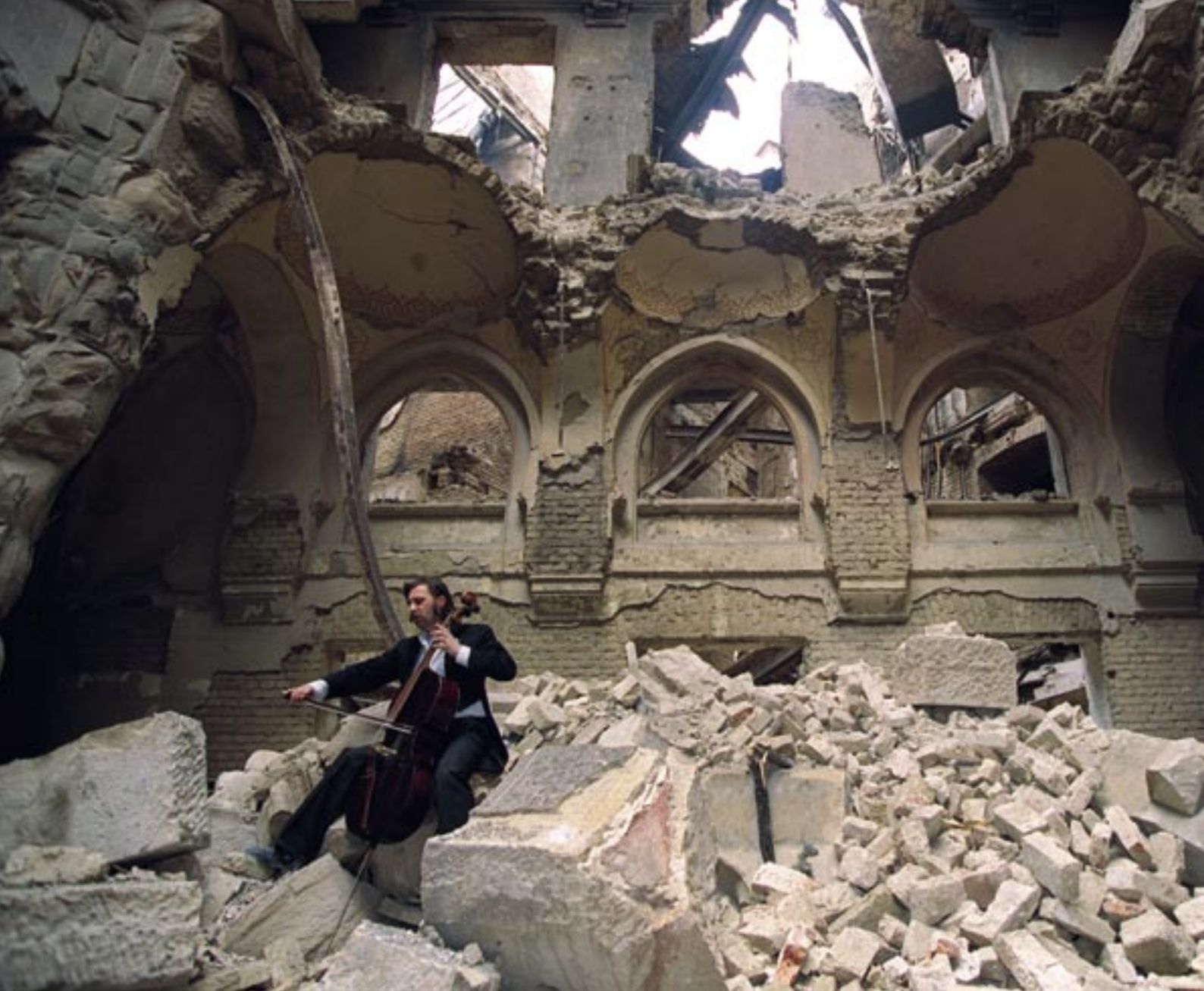
Sarajevo National Library, 1992: Vedran Smailović, the cellist who never stopped playing for peace.