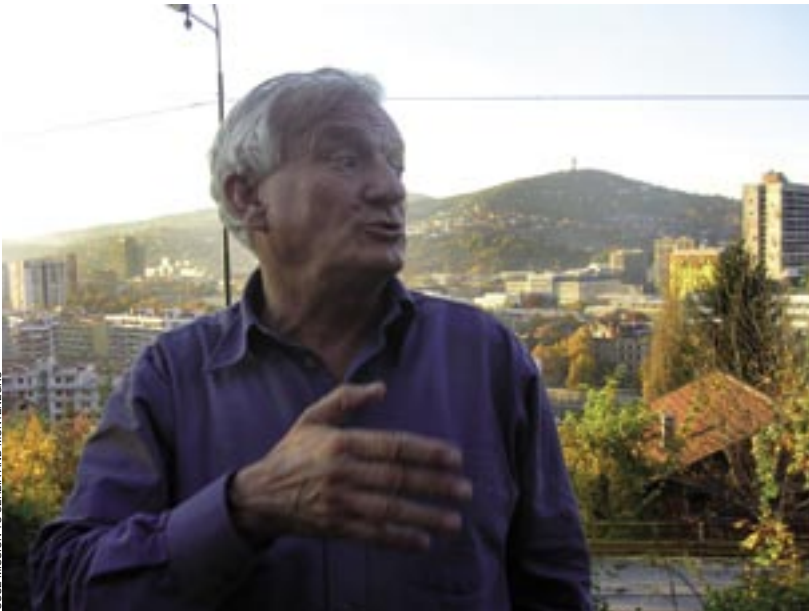
OSCE MISSION TO SERBIA AND MONTENEGRO