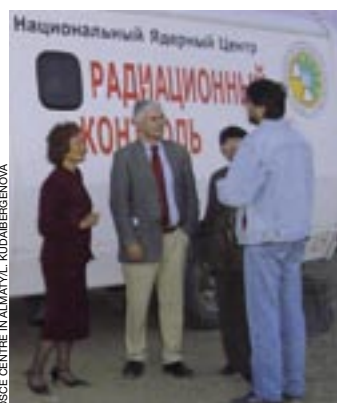
Ambassador Vikki with national partners