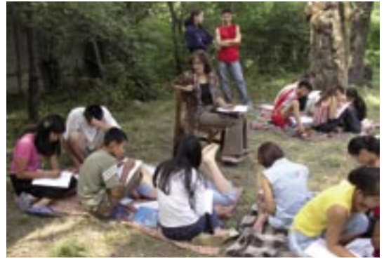
A trainer guides group work.

The future generation is not interested in nature. It is so pleasant to walk in the steppes, smelling the forest and yellowed grass. Why don't we have "ecology" as a subject in our curriculum?