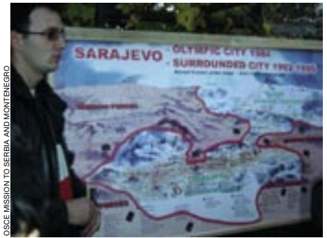
OSCE MISSION TO SERBIA AND MONTENEGRO