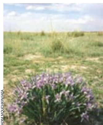
Wild irises on the steppes

To fill the information gap and clarify inaccurate reports stemming from rumours and newspaper accounts, the OSCE Centre initiated