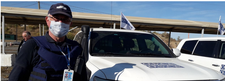
SMM monitoring officer at the Novotroitske EECP, Donetsk region