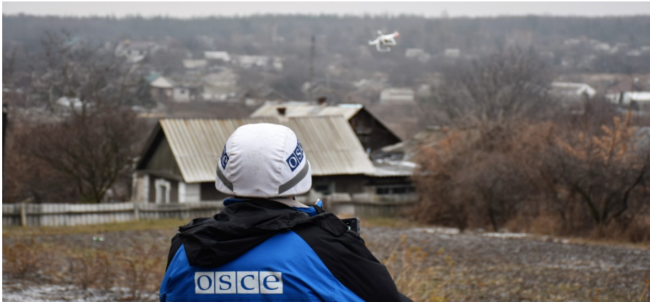
An SMM monitoring officer flying a UAV in Avdiivka, Donetsk region