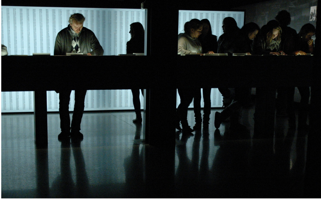
Students studying prisoners' cards at the Falstad Centre.