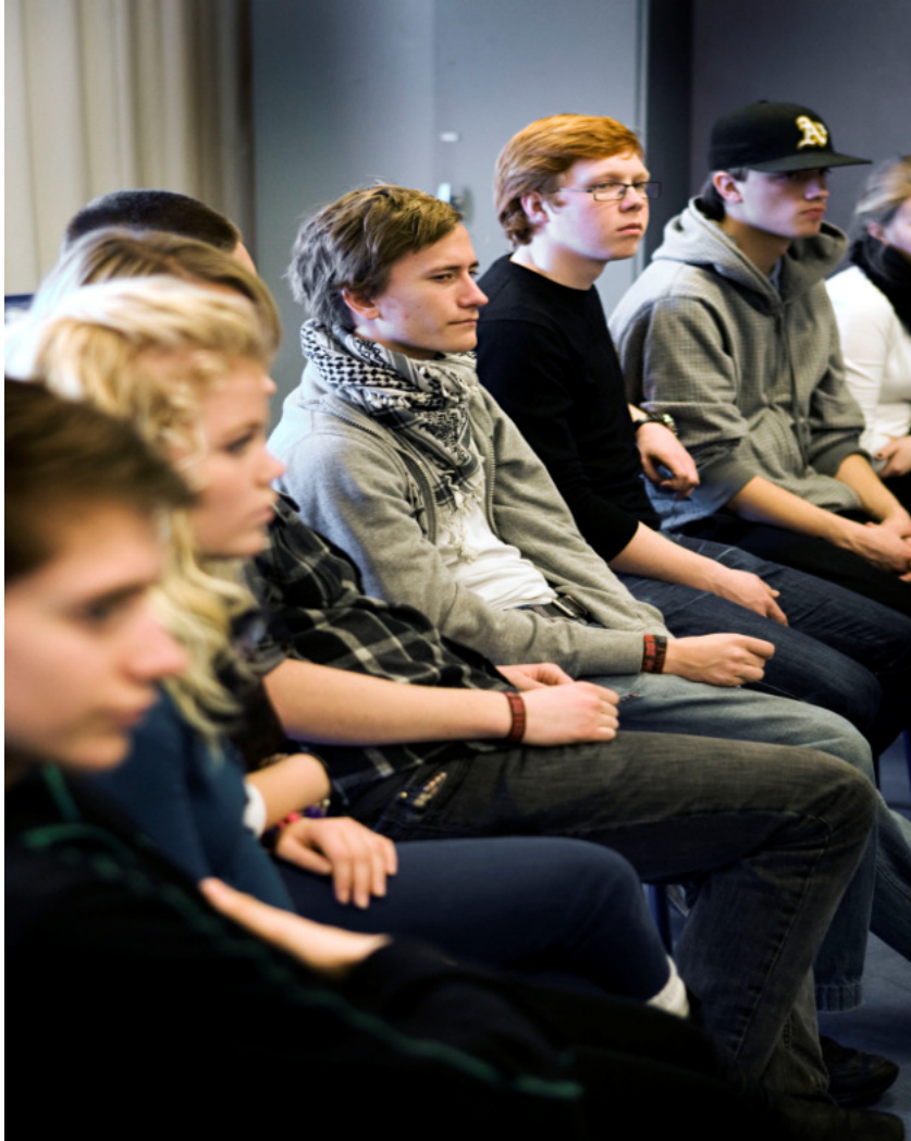
Students participating in an education seminar on the commemoration of the Danish Auschwitz Day, January 2009.

Information provided by the Ministry of Foreign Affairs of Denmark, in a communication dated 15 November 2011, in response to ODIHR's online questionnaire. The communication also cited two websites where lists of events are posted and further information is available: < www.27.1.dk > and < www.mindelunden-4maj.dk >.