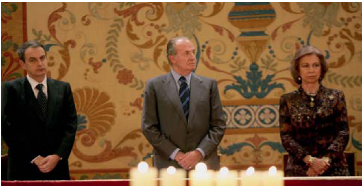
His Majesty the King Juan Carlos I, Her Majesty the Queen Sofia and the President of the Government, José Luis Rodríguez Zapatero, at the Holocaust Remembrance Day ceremony, January 2006.

The official day for remembrance is always preceded by a seminar on the same theme as the year's commemorative event.