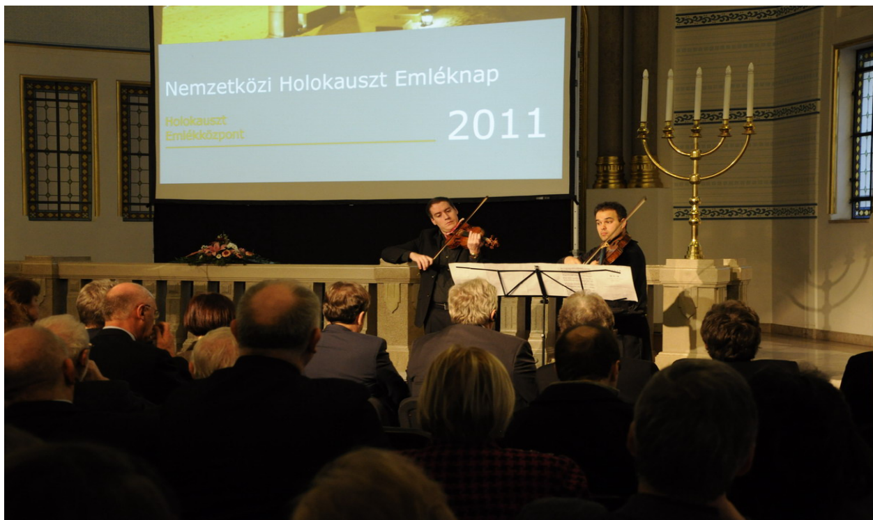
Concert in the historic synagogue building of the Holocaust Memorial Centre commemorating International Holocaust Remembrance Day, 27 January 2011.

Every year there is a commemoration event at the Memorial for the Roma Genocide. There are commemoration events at the Holocaust Memorial Centre as well. The commemoration events include speeches, exhibitions and concerts. Events are organized by local governments, Holocaust commemorative organizations, non-governmental organizations and Roma organizations. Government representatives, sometimes even the President or ministers, attend the main memorial event.