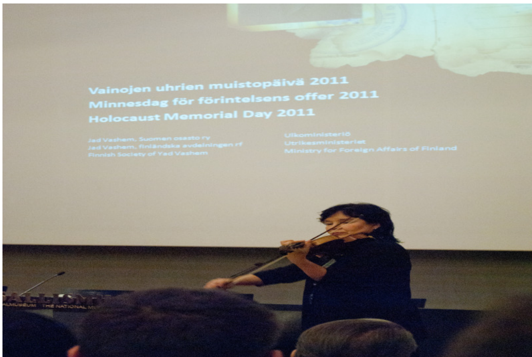
Holocaust Memorial Day 2011, main event organized by the Finnish Society of Yad Vashem and the Ministry for Foreign Affairs.

Information provided by the Permanent Mission of Finland to the OSCE, in a communication dated 31 October 2011, in response to ODIHR's online questionnaire.