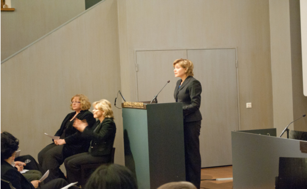
Minister of Education Henna Virkkunen giving a speech on the commemoration of the Holocaust Memorial Day in Finland, 27 January 2011.