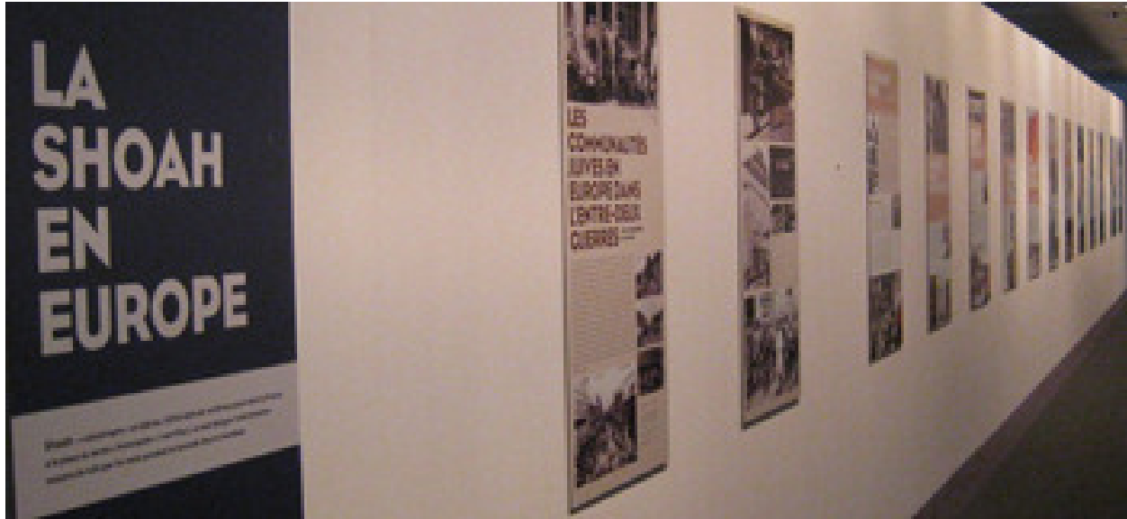
Exhibition at the Shoah Memorial, 27 January 2011.

Information taken from the website of the ITF, July 2012, and from a communication from the French Delegation to the ITF, dated 30 September 2009. The Permanent Representation of France to the OSCE confirmed, in a communication dated 31 January 2012, that ODIHR could use the information on the ITF website for publication purposes.