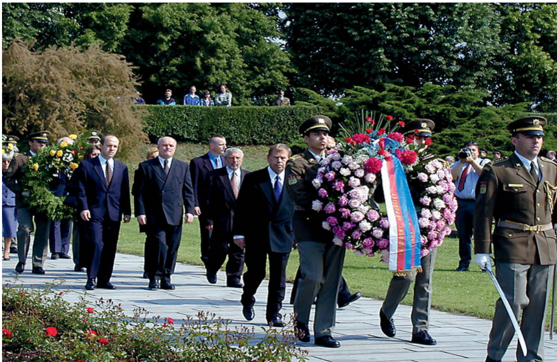
Former President of the Czech Republic, Václav Havel, at the Terezín Commemoration.

The Museum of Romani Culture in Brno commemorates Holocaust Memorial Day on 27 January each year. The museum’s Holocaust memorial activities have become a regular part of its offer to schools. In 2011, the museum held an interactive programme for pupils and students in co-operation with the Jewish Museum in Prague. The programme focused on both the Holocaust and the broader issues of genocide, racism and xenophobia, and included lectures on the history, dates and events in the history of the Holocaust and the genocide against Roma and Sinti. It included discussions, meetings with survivors, screening of a short documentary film and an exhibition of photographs.