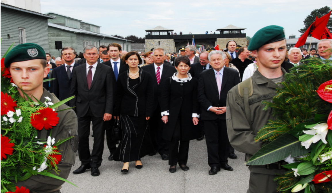
A commemoration ceremony on the 66 th anniversary of the liberation of Mauthausen Concentration Camp, near Linz, in Oberösterreich (Upper Austria), 8 May 2011.