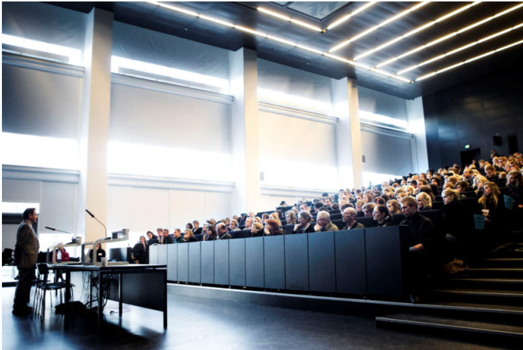
Students participating in an education seminar on the commemoration of the Danish Auschwitz Day, January 2009.

The main 5 May event is a memorial ceremony in Mindelunden, where members of the resistance to Nazism were executed. Christmas Eve is also marked in Mindelunden in commemoration of the fallen members of the resistance movement. On the morning of 5 May, flowers are laid on the graves and monuments related to the resistance movement. In the evening there is a ceremony with speeches and music. The event in Mindelunden is organized by Kammeraternes hjælpefond (the Aid Foundation of the Comrades) and is promoted on the official webpage, < www.mindelunden-4maj.dk >.