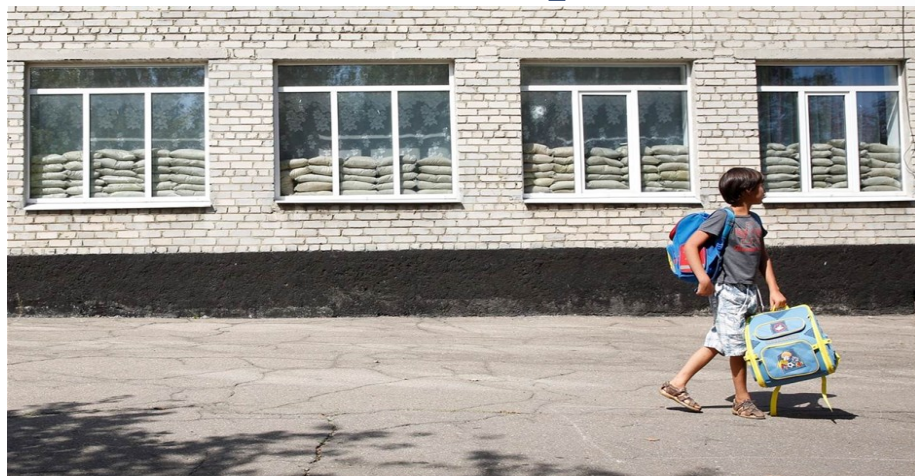
A student at school close to the contact line, Donetsk region