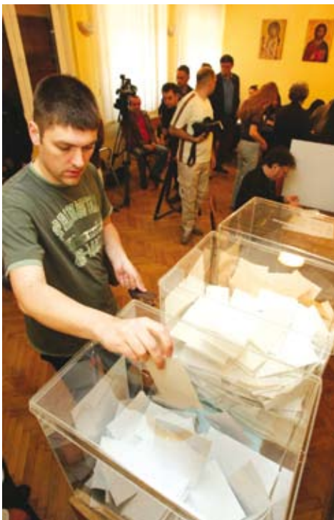
Voter turnout was reasonably high at Serbian parliamentary elections, Belgrade, 11 May 2008.

» Challenges new and old: Along with transparency, accountability and confidence in the electoral process, the need to ensure the universal right to participate for voters and candidates alike remains a challenge. Issues to be addressed in this area include the participation of women and national minorities, and access for disabled voters. Other groups that may also be more vulnerable to having their electoral rights curtailed include the sick or elderly, military personnel and people in detention. The nature and monitoring of campaign financing are also emerging challenges addressed by ODIHR in its activities.