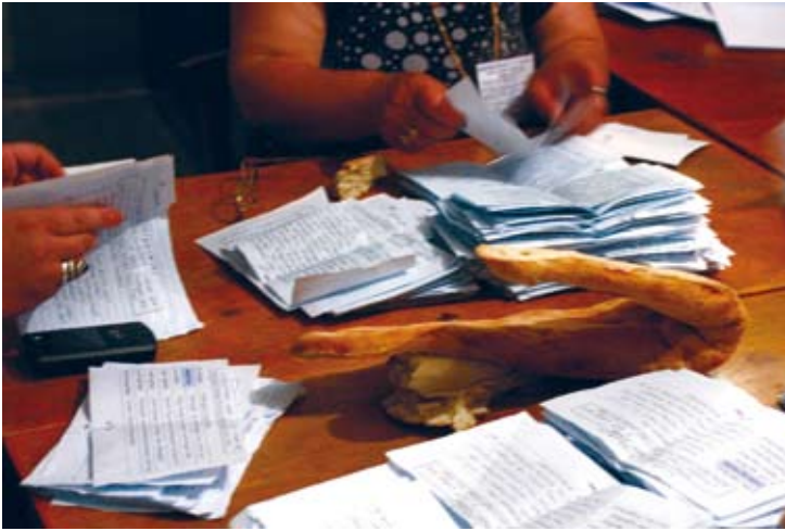
Ballots are sorted at a polling station in Sakobo, Kakheti region, for the 21 May 2008 parliamentary elections in Georgia.