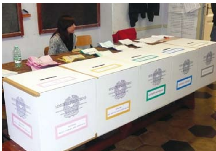
Ballot boxes at a polling station in Rome, for elections to the lower chamber of parliament, senate, provincial government, mayor and municipal council, 13 April 2008.

timely mechanisms for the protection of electoral rights at all stages in the election process, including: the registration of voters, political parties and candidates; the election campaign; the vote itself; and the counting of ballots and declaration of results. In particular, this often involved the absence of the opportunity to file complaints over a lack of equitable access to the media or the allocation of state resources.