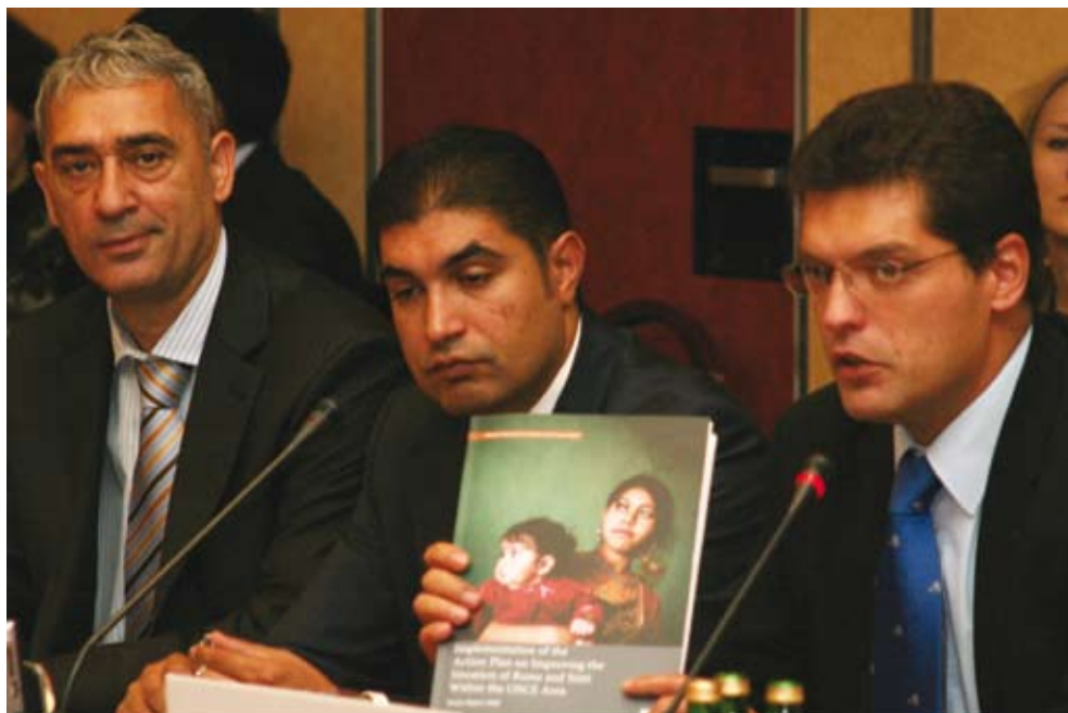
ODIHR Director Janez Lenarčič (right) launches a report on the situation of Roma and Sinti in Warsaw, 2 October 2008.

and Sinti of their ability to influence their own circumstances through political participation often compounds the problem. The most vulnerable groups among these communities, such as women, young people, internally displaced persons, refugees and returnees, are particularly affected.