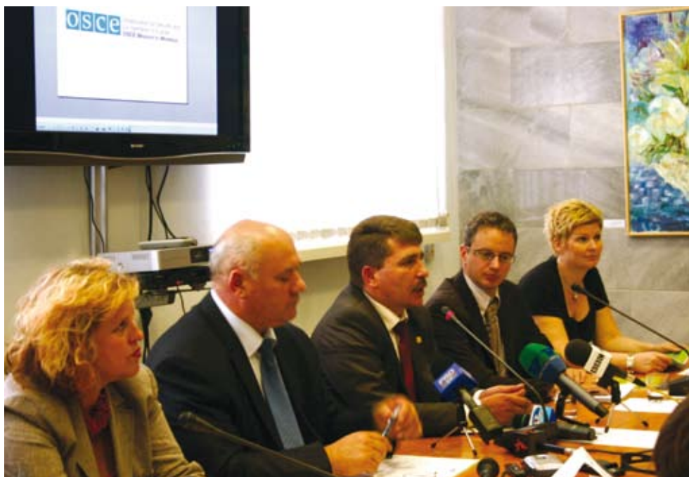
The presentation of a report on the OSCE Trial Monitoring Programme for the Republic of Moldova, in Chisinau 19 June 2008.

Soviet countries. Thirty experts from 19 countries attended the workshop. Background reports were commissioned by ODIHR to ensure an informed debate, and the summary report from the workshop contains recommendations to policy-makers and examples of good practices in the participating States. The expert seminar also strengthened ODIHR's capacity to systematically address reform of the legal profession. The workshop summary and background reports are available on the ODIHR website.