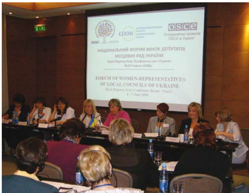
Participants at the Forum of Women Representatives of Local Councils in Ukraine meeting 6 June 2008 in Kyiv.

in the regions outside the capital. In addition, the Coalition members launched an awareness-raising campaign to gather support for amendments to electoral and political party legislation guaranteeing equal representation for men and women, and collected the 32,000 signatures from supporters of the amendments required by Georgian law to introduce a legislative initiative. The proposed amendment would mandate at least 40 percent representation for both sexes in the parliament, and would impose fines for political parties and other actors in the electoral process for violating this principle.