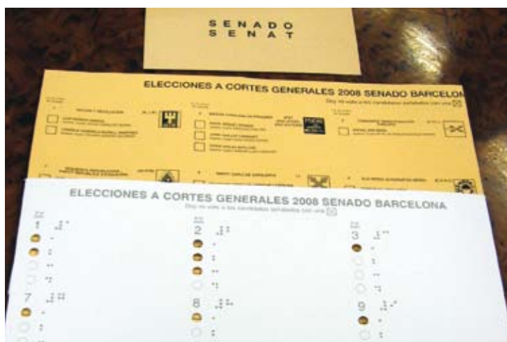
A ballot paper in braille for the 9 March 2008 parliamentary elections in Spain.

► Democratic standards: Much progress has been made in many OSCE participating States in bringing electoral practices in line with commitments based on the 1990 OSCE Copenhagen criteria, which serve as the basis for ODIHR's assessment of individual elections. While there have been improvements in the legal and administrative framework for elections, these improvements only make a difference if they affect actual practice. Therefore, ODIHR also continues to report serious flaws in the conduct of elections in a number of OSCE participating States. The list of shortcomings observed in one or more states is extensive, including the restriction of fundamental freedoms, limitations of the opportunity and right to run for public office, impediments to universal and equal suffrage resulting from inadequate voter registration, inequitable media access and biased coverage favouring particular candidates or parties, the abuse of state administrative resources, limitations on access for domestic and international observers, ineffectual complaints and appeals procedures, and fraud during the counting and tabulation of votes.