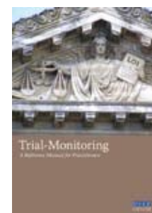
A reference manual for practitioners of trial monitoring

In November 2008, ODIHR organized a Trial Monitoring Conference, hosted by the OSCE Spillover Mission to the former Yugoslav Republic of Macedonia, in Skopje. Representatives of OSCE field operations discussed the reference manual and issues of mutual concern, including limitations on access to hearings and court files, confidentiality and ways to enhance the impact of trial monitoring through a stronger focus on advocacy and capacity building. Follow-up meetings with field operations are planned for 2009.