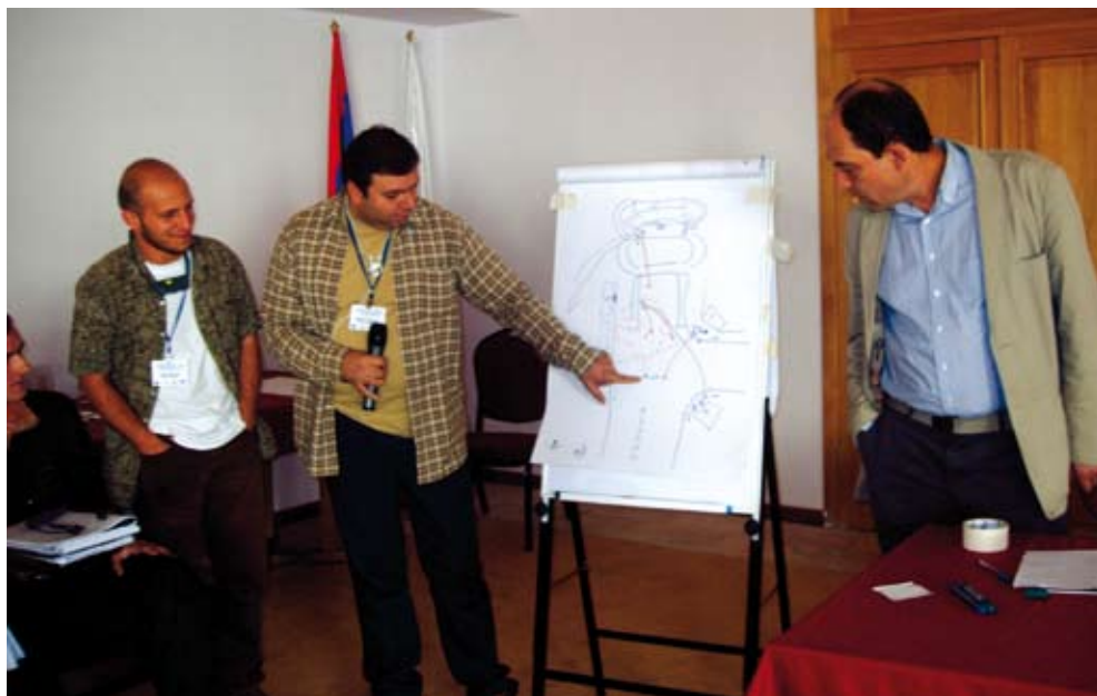
Participants going over practical aspects at organizing peaceful assemblies at a freedom of assembly training programme in Yerevan in September 2008.

patterns of violations affecting human rights defenders in the OSCE area, as well as a number of good practices for protecting these people and organizations and creating an enabling environment for their work. The issues and practices highlighted in the report inform the elaboration of programmes to help participating States comply with their OSCE human dimension commitments.