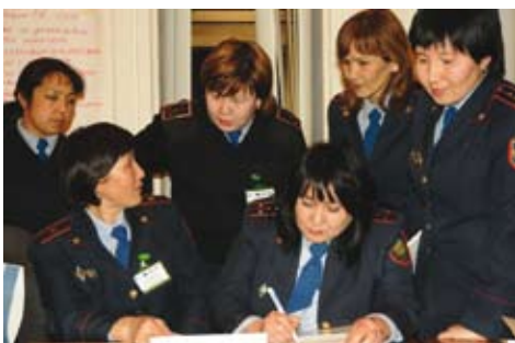
Kazakhstani police women join government officials and civil society representatives to discuss co-operation on promoting and monitoring women's rights, Almaty, 11 December 2008.

The forum adopted a number of recommendations, including a call for the creation of a National Association of Women Members of Elected Councils. Other areas for co-operation identified included: the effective implementation of existing legislative provisions for promoting and upholding equal rights and opportunities for men and women in Ukraine; the introduction of amendments to national legislation that would create special mechanisms for increasing women's representation in elected bodies at different levels of government; and the development of an intra-party approach to gender-balanced candidate lists.