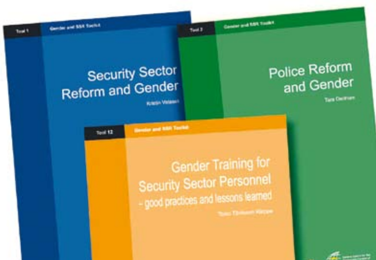
Toolkit on Gender and Security Sector Reform

Another exchange visit, to Italy, was organized by ODIHR in December for Serbian social service providers working with victims