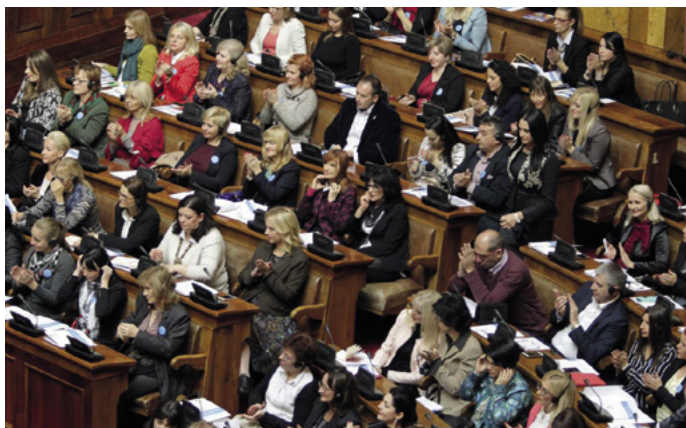
ODIHR supports networks of women parliamentarians.