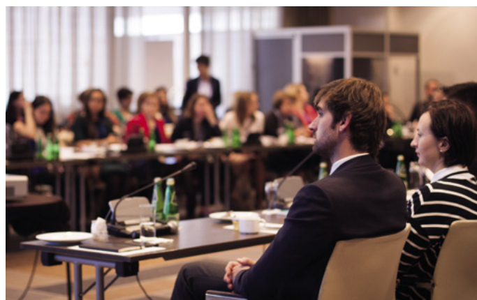
ODIHR brings women and men together to discuss reforming political parties to support women's participation.