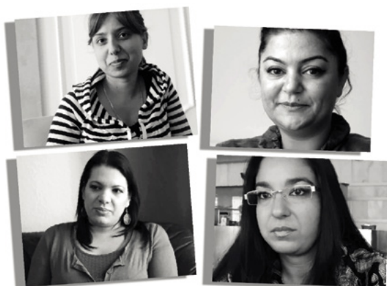
An ODIHR video features interviews of Roma women who have made significant contributions to policy development at the national and international levels.

Roma and Sinti women face multiple discrimination, based on both their ethnicity and gender. ODIHR, through its Contact Point for Roma and Sinti Issues, assists participating States in the implementation of commitments targeting Roma and Sinti women through its programmatic activities on the particular issues they face. ODIHR also organizes consultation meetings with Roma and Sinti women civil society representatives and mainstreams gender, with a special focus on the equal and meaningful participation and representation of Roma and Sinti women, and placing issues affecting women on the agenda.