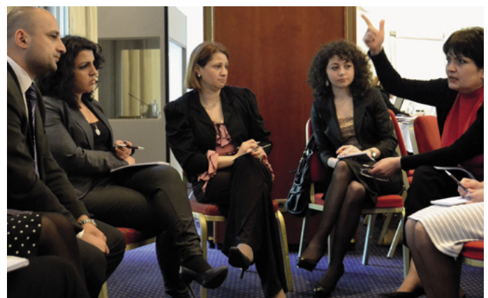
Participants discuss how women can strengthen their political campaigning capacities at a seminar co-organized by ODIHR on increasing women's participation in political parties in Georgia.