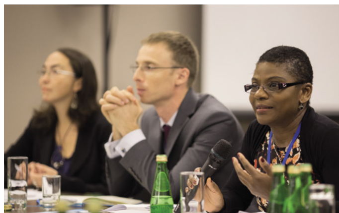
A judge speaking at an event on diversity and the judiciary: promoting full and equal participation of women and minorities.