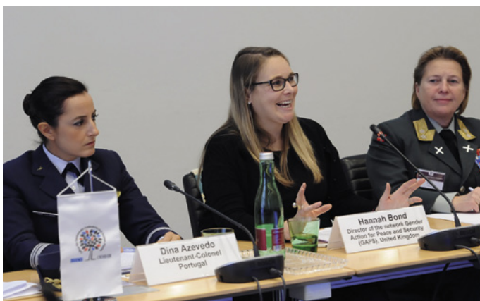
An ODIHR organized seminar on boosting the reporting on the implementation of the Women, Peace and Security Agenda.

gender equality, as described in the 2004 OSCE Action Plan for the Promotion of Gender Equality and the Ministerial Council decision on Women's Participation in Political and Public Life . The OSCE has also acknowledged the particular situation of Roma and Sinti women since 2003, with its Action Plan on Improving the Situation of Roma and Sinti within the OSCE Area . The Action Plan calls for systematic mainstreaming of Roma and Sinti women's issues, as well as supporting their access to employment, health care, education and political and social participation, with special attention paid to this support in crisis and post-crisis situations. In conformity with gender equality commitments, ODIHR has undertaken