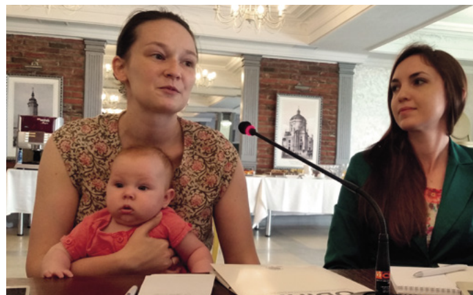
An ODIHR workshop in Ukraine on mainstreaming gender into communications welcomed participants with childcare responsibilities.