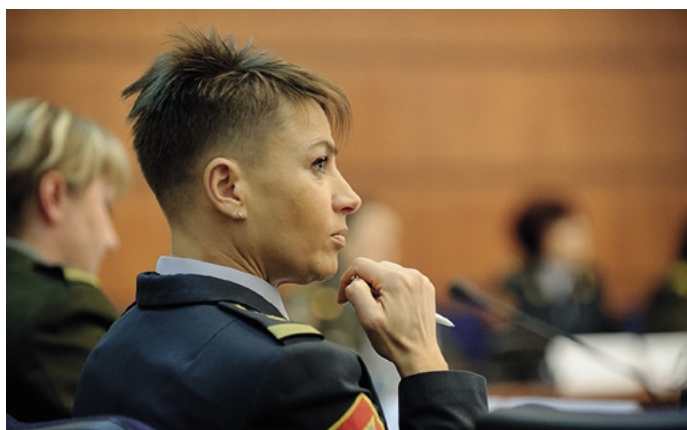
A training event on women's participation in the security sector.

A justice system reflecting the composition of its society inspires greater trust in justice institutions. All individuals, regardless of their gender or other characteristic, should benefit from the same opportunities to access legal education and professions. ODIHR's programme on gender, diversity and justice identifies gaps and good practices in promoting diversity in justice systems and seeks to sensitize legal professionals, executive and justice administration bodies, and civil society to relevant legal and institutional improvements.