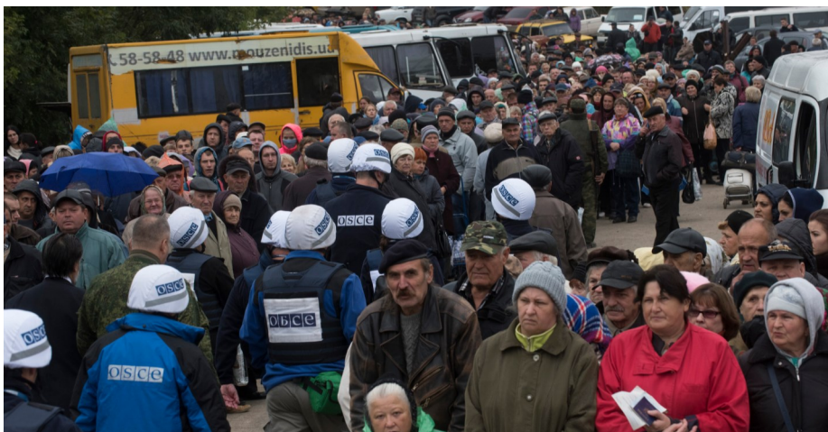
Civilians queuing at the Stanytsia Luhanska exit-entry checkpoint, Luhansk region, September 2016.