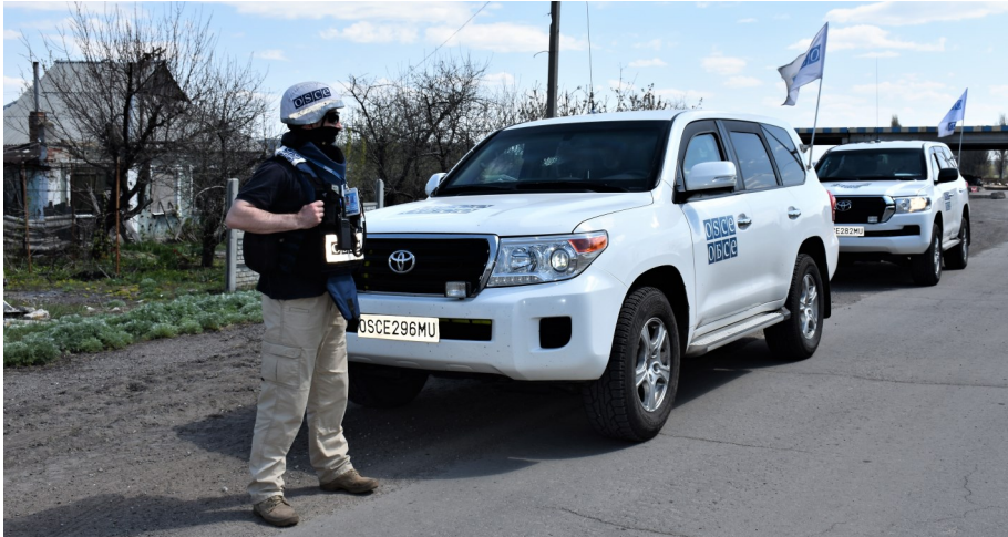
SMM patrol near Donetsk Filtration Station, Donetsk region