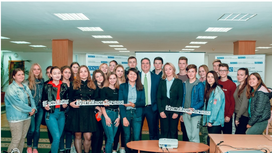
Participants at an SMM outreach event at the Lesya Ukrainka East European National University in Lutsk, Volyn region