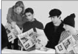
OSCE Spillover Monitor Mission to Skopje

The exchange of views and information revealed both positives and nega-