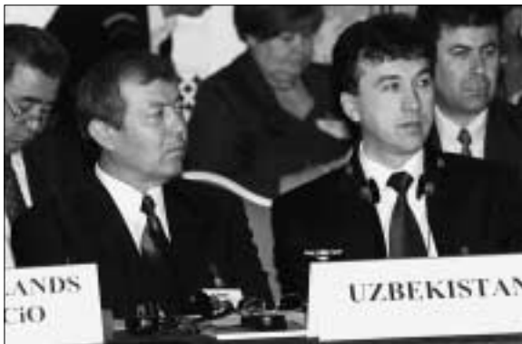
About 170 experts, including Uzbek officials, examined the hidden and obvious economic consequences of trafficking in drugs.

In analytical detail, discussions revealed the shared characteristics of different forms of trafficking. Trafficking networks often function like well-organized multinational companies. They are interlinked with other criminal activities, including terrorism and violent conflict.