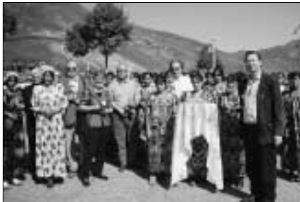
Heads of OSCE delegations who visited the Kulyab Office on 9 May received a warm welcome by local leaders

Twenty-six judges from all over Kazakhstan have taken part in a project to develop economic courts, which were introduced to the country a year ago. The judges were trained in court practices from 25 to 28 March and participated at a