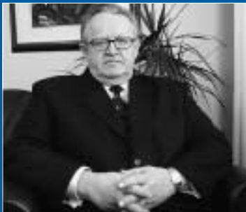
Crisis Management Initiative

Earlier in his career, he served as Finland's Ambassador to several African countries, after which he served in senior positions at the United Nations, including those of Special Representative of the Secretary-General for Namibia and Under-Secretary-General for Administration and Management.