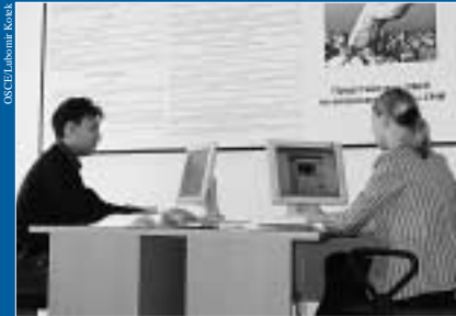
A first: the Internet Café for journalists in Almaty, Kazakhstan

Cyberspace provides Internet users with more information than any other source. The Web is supposed to be World Wide, but is it really? And what impact has this technology been having on freedom of the media and freedom of expression worldwide?