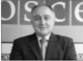
Ambassador Ahmet Erozan

As part of the OSCE's efforts to strengthen its activities in the politico-military and economic and environmental dimensions [see story, page 7], the Centre in Tashkent has received an additional 450,000 euros for several new projects in areas as diverse as developing small and medium-sized enterprises, managing water resources and combating trafficking in drugs and arms.