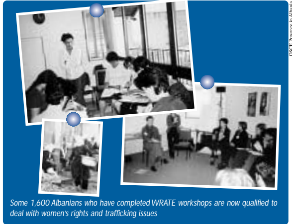
Some 1,600 Albanians who have completed WRATE workshops are now qualified to deal with women's rights and trafficking issues

Raising people's consciousness about the relationship between human rights, women's rights and anti-trafficking issues is at the heart of the WRATE project, and we intend to stay the course by maintaining the momentum of the awareness campaigns. We plan to continue holding regional workshops and extend them to the north-eastern part of