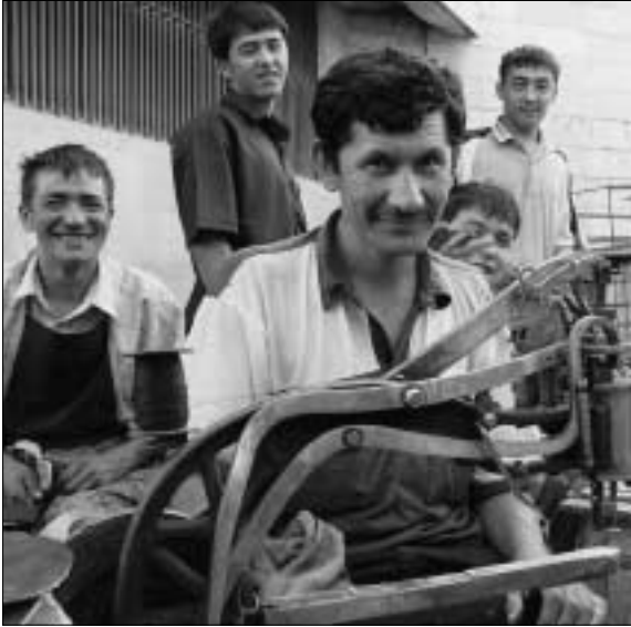
A shoemaker in Bishkek does his share for the Kyrgyz economy

The money is being poured into new ideas for building up the countries' economic structures as well as for alleviating ecological problems. Projects range from developing small and medium-sized enterprises and fostering women's participation in business, to supporting water management schemes.