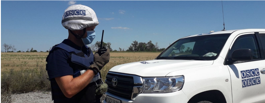
Monitoring officer near Berdianske, Donetsk region