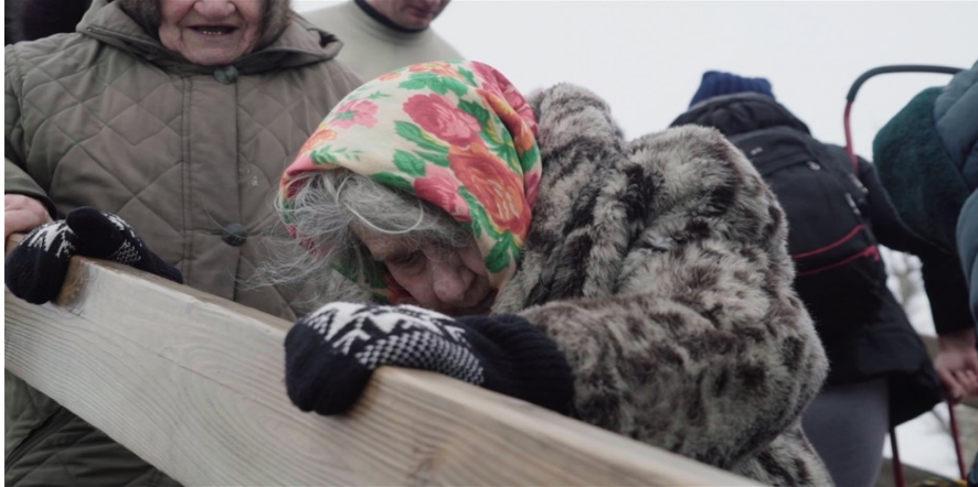
Civilians passing through the entry-exit checkpoint near Stanytsia Luhanska, Luhansk region