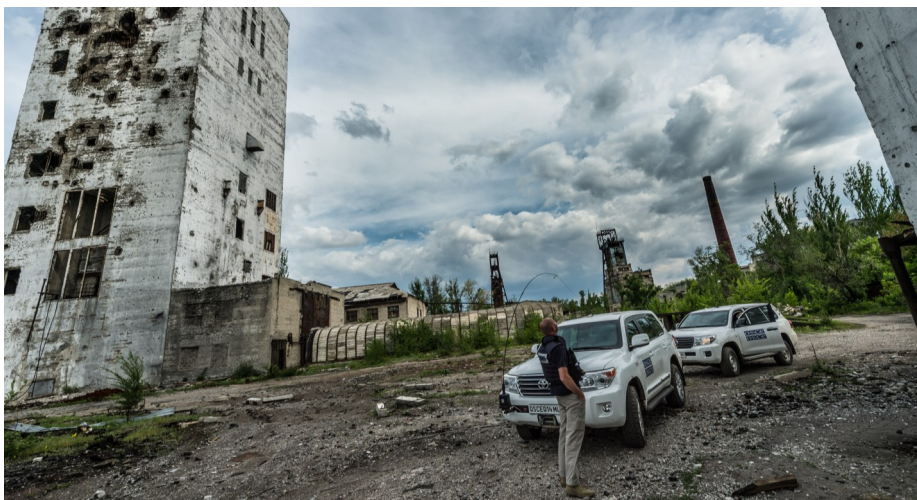
OSCE SMM monitors at the Oktiabr mine, Donetsk region, May 2016.