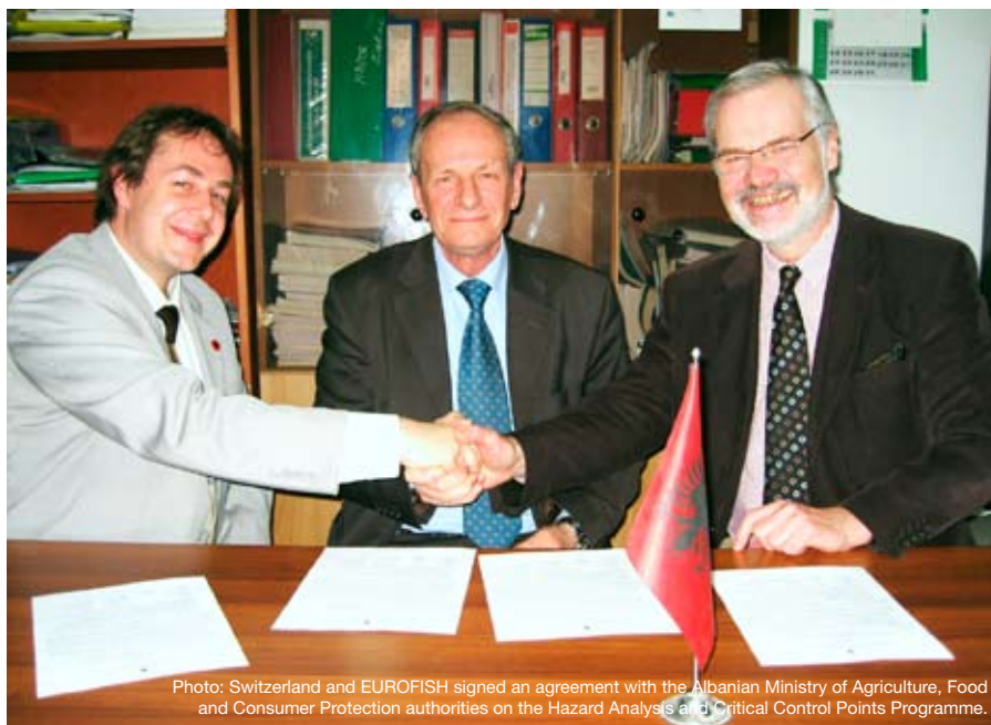
Photo: Switzerland and EUROFISH signed an agreement with the Albanian Ministry of Agriculture, Food and Consumer Protection authorities on the Hazard Analysis and Critical Control Points Programme.

Switzerland and the International Organisation for the Development of Fisheries in Eastern and Central Europe (EUROFISH) signed an agreement with the Ministry of Agriculture, Food and Consumer Protection on the Hazard Analysis and Critical Control Points (HACCP) Programme to focus on providing support in food safety systems. The project between the Swiss Import Promotion Programme (SIPPO), the EUROFISH and the Ministry will focus on providing meetings with the relevant authorities for Food and Veterinary Inspection and officials from the fish processing industry in Albania; a workshop to cover the pre-requisite programme and the HACCP approach; and an evaluation