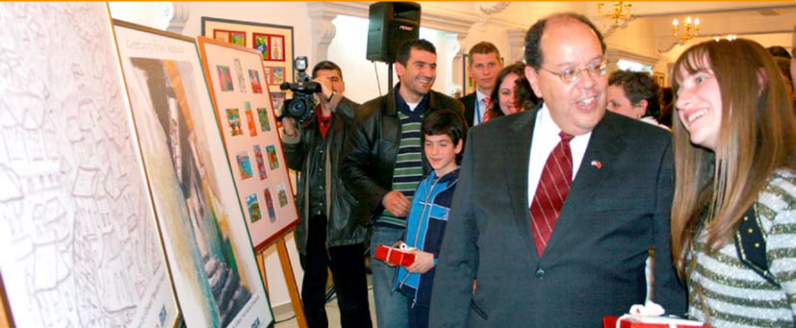
Photo: U.S. Ambassador John L. Withers, II meets with winners of USAID's "Greetings from Albania" postcard competition to promote tourism to Albania.

The ceremony was attended by the Minister of Public Works, Transport and Telecommunications, Sokol Olldashi, the Minister of European Integration, Majlinda Bregu and the Ambassador of Italy in Albania, Saba D'Elia.