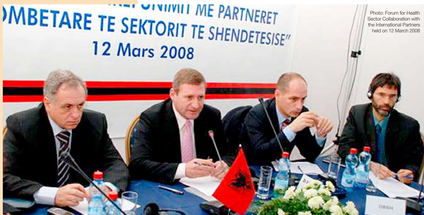
Photo: Forum for Health Sector Collaboration with the International Partners held on 12 March 2008

and equipment provision of 5 policlinics in Albania: the above mentioned in Tirana and three others in Korca, Gjirokastra and Peshkopi. The fund is composed of a 5 million Euros loan to the Government and an additional 110,000 Euros granted as technical assistance. Work in Tirana will conclude in January 2009. In Korca, the contractor responsible for the rehabilitation is going to be selected by the Ministry of Health according to the regular tender procedure. The planning for the rehabilitation of Gjirokastra and Peshkopi policlinics is currently underway.