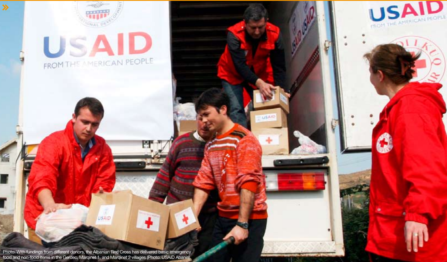
Photo: With fundings from different donors, the Albanian Red Cross has delivered basic emergency food and non-food items in the Gerdec, Marqinet 1, and Marqinet 2 villages.