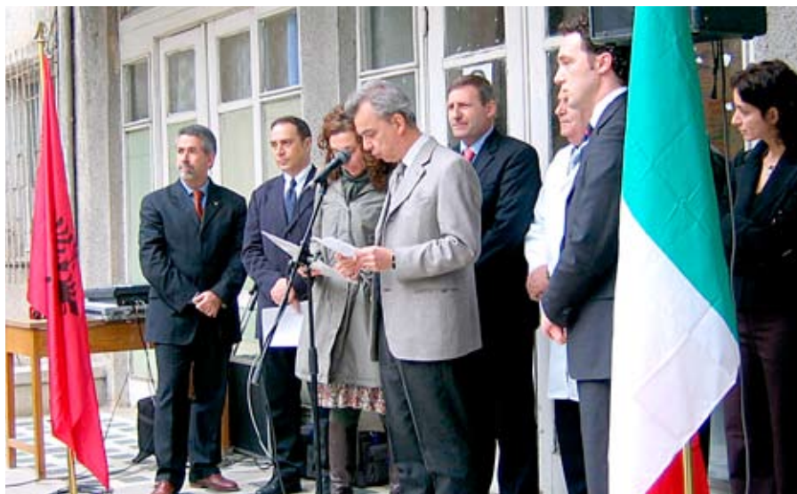
Photo 1. Inauguration of the rehabilitation works in Tirana Policlinics no. 2 and 3.