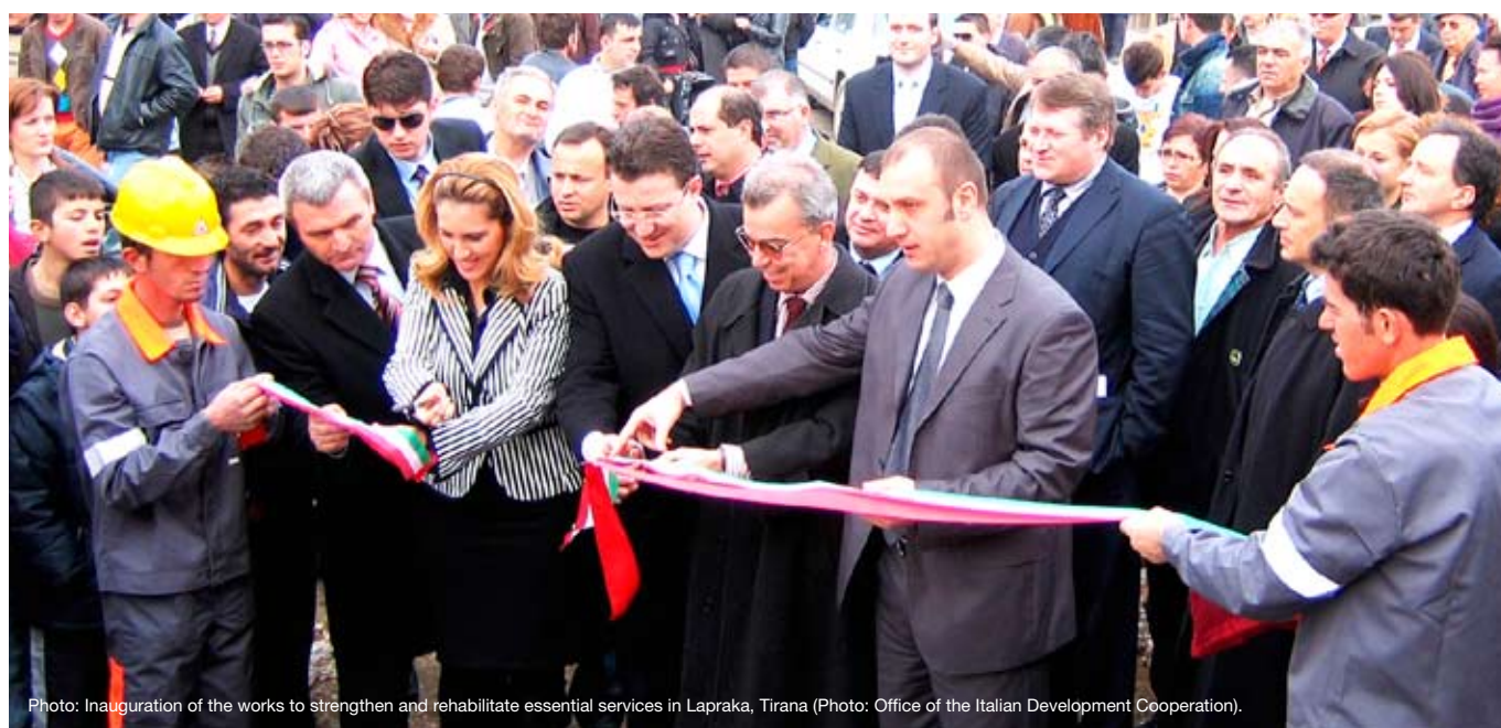
Photo: Inauguration of the works to strengthen and rehabilitate essential services in Lapraka, Tirana (Photo: Office of the Italian Development Cooperation).

On 21 February 2008, a ceremony was held in Tirana, to celebrate the inauguration of the works aimed to rehabilitate and foster essential services in Lapraka (Tirana). This event took place in the framework of the programme Tirana Suburbs funded by the Italian Development Cooperation, through a 3 million Euros loan to the Government. The main aim is to improve living conditions through the rehabilitation or construction of local water supplies and sanitation, paving of roads and improvement of the electricity and telephone networks. Works are envisaged to be completed in one year.