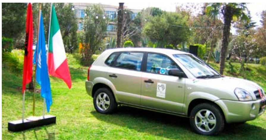
Photo: The rummage vehicle donated to national authorities to foster border control capacities.

On 10 March 2008, a ceremony took place in Tirana, delivering to national authorities the rummage Vehicle and Anti Drug Contraband Equipment, aimed to improve the effectiveness of the inspections at the Morin Border in Kukës. This initiative took place as part of the project Strengthening of Enhanced Border Control Capacities and Criminal Justice response Towards Illicit Trafficking and Organized Crime in Albania supported by the Italian Ministry of Foreign Affairs–Development Co-operation through a 1 million USD fund, and implemented by UNODC.