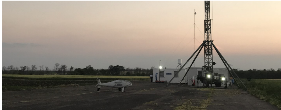
SMM long-range UAV base in Stepanivka (OSCE)