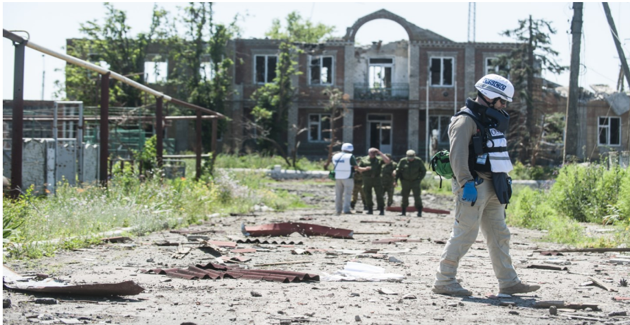
SMM observed a significant decrease in ceasefire violations in Donbas, but the situation remained tense