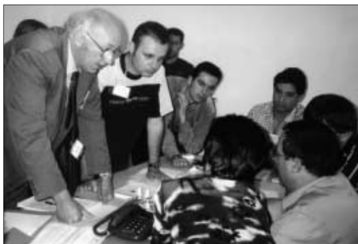
Parliamentary Assembly Vice President Bruce George leading the international observation team for the Albanian parliamentary elections

At the invitation of the Speakers of the two Chambers of the Canadian Parliament, the President of the Parliamentary Assembly (PA), Adrian Severin, paid an official visit to Canada, on 11