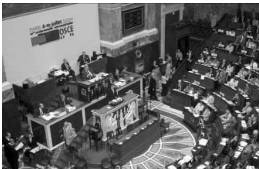
This year's Parliamentary Assembly met in Paris at the Assemblée Nationale

The Paris Declaration also contained resolutions on specific issues such as abolition of the death penalty; the prevention of torture, abuse, extortion or other unlawful acts; combating trafficking in human beings; combating corrup-