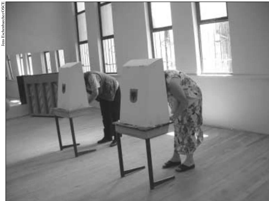
Albanian citizens marking their ballots during the parliamentary elections held on 24 June

A s part of its online photographic archive, the Press and Public Information Section has launched an OSCE 'Photo of the month' competition. The winner for July 2001 can be found on the OSCE online photo archive – www.osce.org/photos – where interested photographers, media and other users can browse images relating to