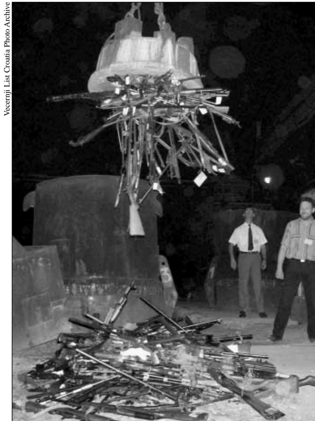
In Croatia, the Government marked the start of the Small Arms Conference in the United Nations by destroying a large quantity of weapons

Implementation of small arms restrictions recently received a boost when Switzerland and Azerbaijan co-hosted a workshop in Baku on 21 and 22 June. The event, entitled 'Small arms and light