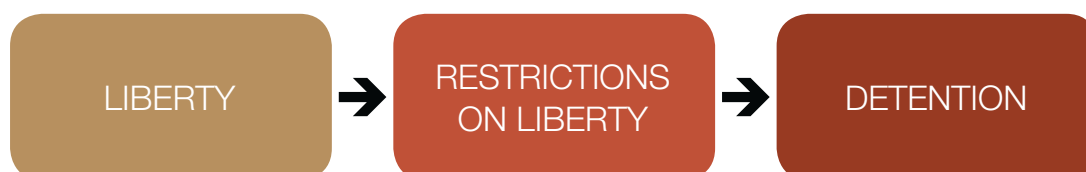
Figure 1 13