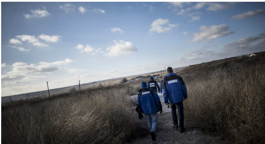
The SMM monitors conducting a foot patrol, December 2015.