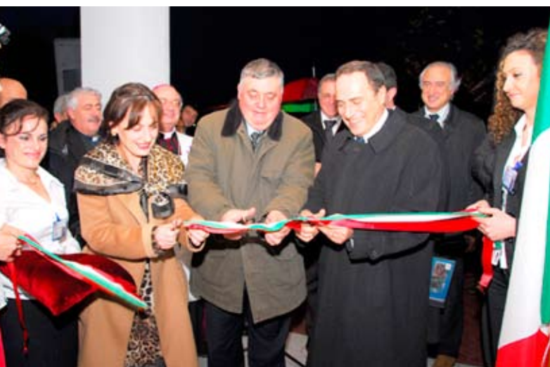
Photo: Inauguration of DOKITA Rehabilitation Centre on 3 December 2008

the Minister of Health, Anila Godo, the Minister of Labour, Social Affairs and Equal Opportunities, Anastas Duro, the WHO Representative, Anshu Banarjee, the Head of the Development Cooperation Office of the Italian Embassy in Tirana, Flavio Lovisolo, and other representatives from the academic community. Funded by Italy through a grant of some 700,000 Euros to the Italian NGO DOKITA, the project aims at improving the health conditions of those in need of rehabilitation therapy through increasing the availability of international standard physiotherapy assistance services. In order to extend the service to Shkodra and Lezha, Italy has recently funded another DOKITA's project Physiotherapy assistance in central and north Albania through a 800,000 Euros grant.