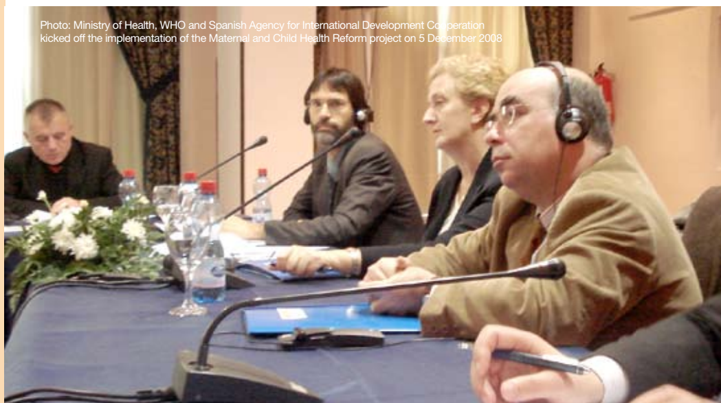
Photo: Ministry of Health, WHO and Spanish Agency for International Development Co-operation kicked off the implementation of the Maternal and Child Health Reform project on 5 December 2008

From November 25 until December 10 2008, USAID/Albania joined the global community in observance of the 16 Days of Activism Against Gender Violence. Beginning on the International Day of Eliminating Violence Against Women and ending on the International Human Rights Day, the 16 Days of Activism provided a forum for advocating for support services for survivors, calling for greater prevention efforts, pressing for legal and judicial reform, and using international human rights instruments to address these issues. As one of the