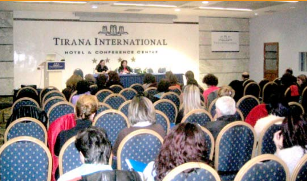
Photo: Conference on Social Inclusion Cross-cutting Strategy monitoring framework held on 17 December 2008

in February 2008. The application of this framework by all institutions involved remains the challenge for the future. The continuity of LSMS implementation is also a crucial issue to be addressed, since LSMS is considered the main information source for the monitoring and evaluation of SICS.