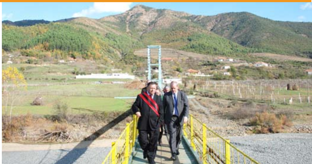
Photo: The inauguration ceremony of a bridge in Rubik, restored under a small grants project funded by the Netherlands Embassy

The OSCE Presence under its project to support the Albanian authorities to create a national probation service held a three-day training of trainers programme from 9 to 11 December 2008. Fifteen lecturers from five universities and four Ministry of Justice experts received training. As a result, 20 trained trainers are now capable to contribute to the drafting of a probation curriculum and can deliver training for future probation officers. The training was designed to facilitate relevant methodical and theoretical background necessary for probation officers to write pre-sentence reports and supervise offenders. On 12 December 2008, in co-operation with the Albanian School of Magistrates, a seminar was held for 24 judges and 16 prosecutors on the role of the probation services. The aim was to facilitate an increased use of