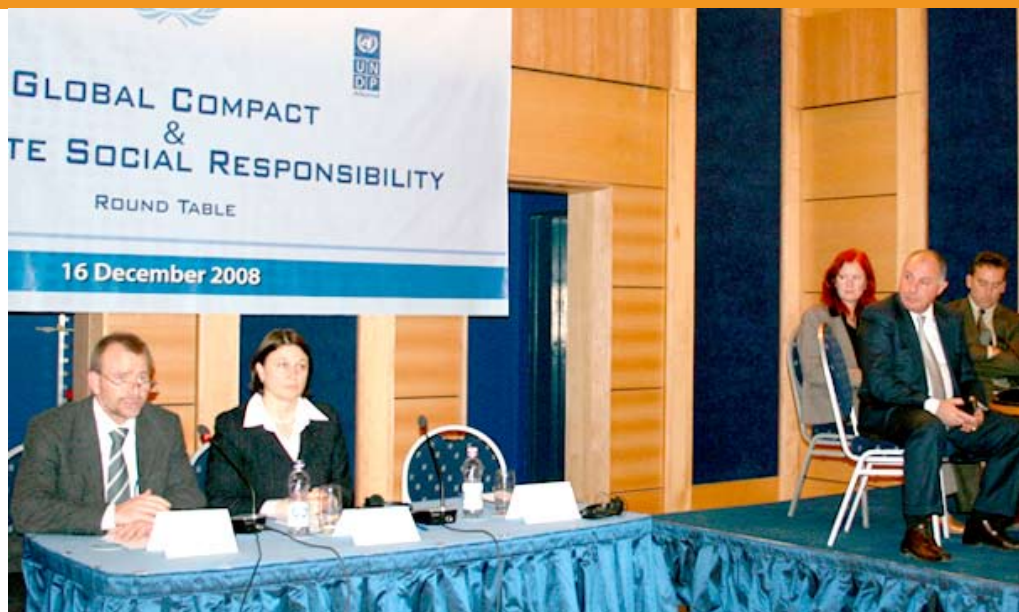
Photo: Global Compact and Corporate Social Responsibility Roundtable held on 16 December 2008

training Albanian companies in fish and seafood sector on hygiene, food safety systems in compliance with Hazard Analysis and Critical Control Points standards. Swiss support has been provided to SMEs relating to seafood, fruits and vegetables as well as garments to participate in the European Seafood Exposition in Brussels, the Global Fashion Fair in Düsseldorf and the Fruit Logistica Fair in Berlin in 2009.