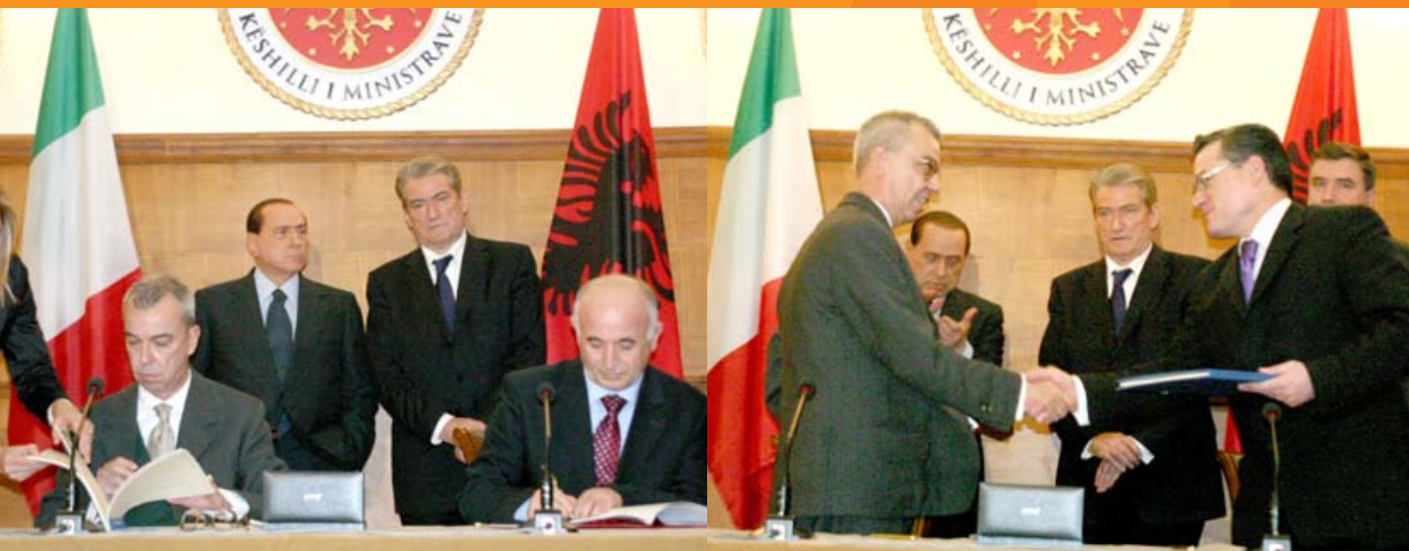
Photo: Minister of Labour, Social Affairs and Equal Opportunities Anastas Duro and Italy Ambassador to Albania Saba D'Elia signed the agreement in the field of labour and the follow-up enforcement protocol during the visit of Prime Minister Silvio Berlusconi