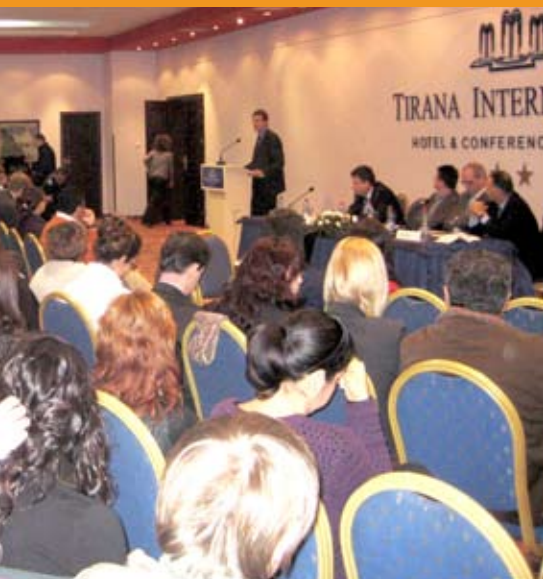
Photo: A well received Human Rights Debate, held on 12 December 2008 on the initiative of and financed by the Netherlands Embassy.