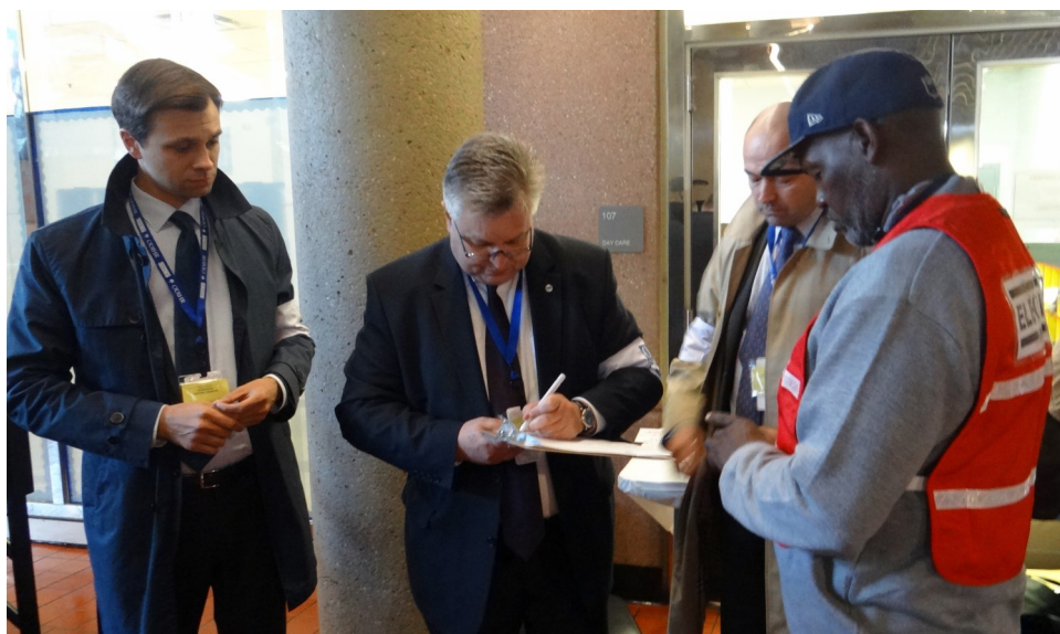
ODIHR Director Michael Georg Link observing at a polling station in Washington during the 8 November 2016 general elections in the United States.

The international election observers from ODIHR and the OSCE Parliamentary Assembly concluded in their preliminary statement that the 8 November U.S. general elections were highly competitive and demonstrated commitment to fundamental freedoms of expression, assembly and association. They also noted that the presidential campaign was characterized by harsh personal attacks, as well as intolerant rhetoric, particularly by one candidate.