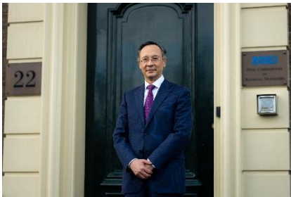
H.E. Mr. Kairat Abdrakhmanov OSCE High Commissioner on National Minorities

Ambassador Kairat Abdrakhmanov of Kazakhstan took up the mandate of OSCE High Commissioner on National Minorities on 4 December 2020. Before taking up the position of High Commissioner, Abdrakhmanov was Ambassador of Kazakhstan to Sweden and Denmark.