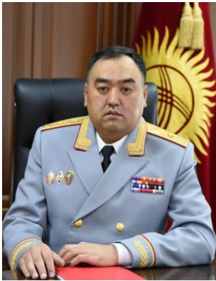
H.E. Mr. Ulan Niiazbekov Minister of Internal Affairs of the Kyrgyz Republic

H.E. Ulan Niiazbekov is serving as Minister of Interior of the Kyrgyz Republic since 2020. Prior to this appointment, he worked in the Ministry (Head Quarter) since 2010 first as Assistant to the Minister, then in 2011 he became Chief of the Financial Department and in 2016 he served as a Deputy Chief of the 7th Department of the Ministry of Interior.