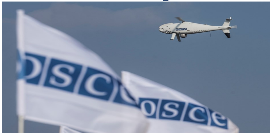
An SMM long-range unmanned aerial vehicle