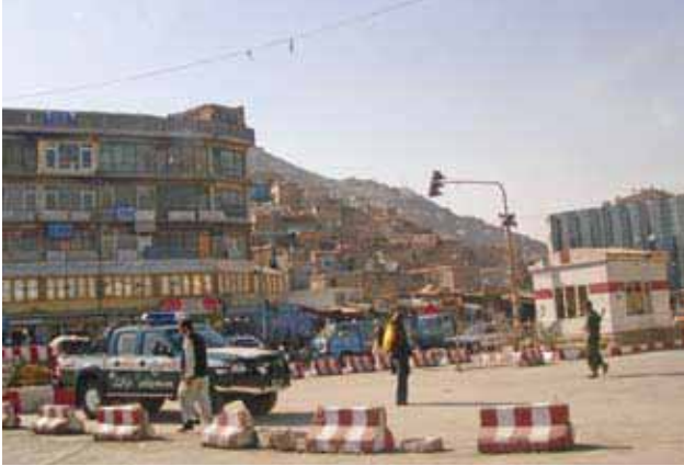
Street scene in Kabul.

The OCEEA also participated in the OSCE Conference in Afghanistan, held in Kabul on 9-10 November 2009. Gathering representatives from several countries of the region, the Conference was an opportunity to present economic and environmental potentials for co-operation with Afghanistan. Together with the Customs Training Development, possible fields of co-operation, such as within the area of transport and water management were explored.