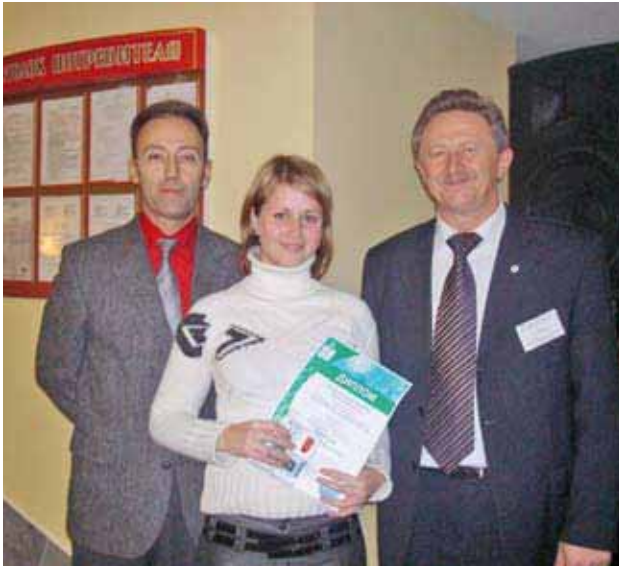
Student and event organizers at a joint OSCE-Sakharov University regional students competition on Environment and Security in Belarus.