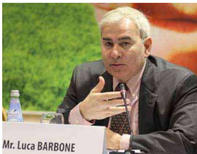
Luca Barbone, Director, Poverty Reduction and Economic Management, Europe and Central Asia Region, World Bank, speaking at the 2 nd preparatory Conference for the 17 th Economic and Environmental Forum, Tirana, 16-17 March 2009.

ate employment opportunities. Within its scope of work, the OSCE will also continue to strengthen bilateral and regional co-operation on economic and migration related issues.