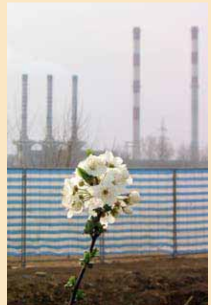
Heating plant in Belgrade.

The OSCE Mission to Serbia, through the Democratisation of the Security Sector Programme , supported a research project on the ecological risks of defence technology in Serbia. The results of the research were published and presented to experts and the relevant authorities in Valjevo, Cacak and Lucane. The main objective of the discussions was to raise awareness on the potential environmental risks associated with the defence industry and to encourage Government officials to include a broader audience in the decision making processes concerning defence related issues.