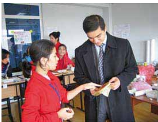
Eco-design workshop in Tashkent. (NGO “Ekomaktab”)

In co-operation with the World Bank, the OSCE Project Co-ordinator in Uzbekistan supported the NGO “Eko-maktab” and the Youth organization “Kamolot”, both of them are working with school children with disabilities. The project aimed at combining personal and professional development with ecological education and awareness-rising on nature protection. In the course of this project several training seminars on eco-design took place in Tashkent.