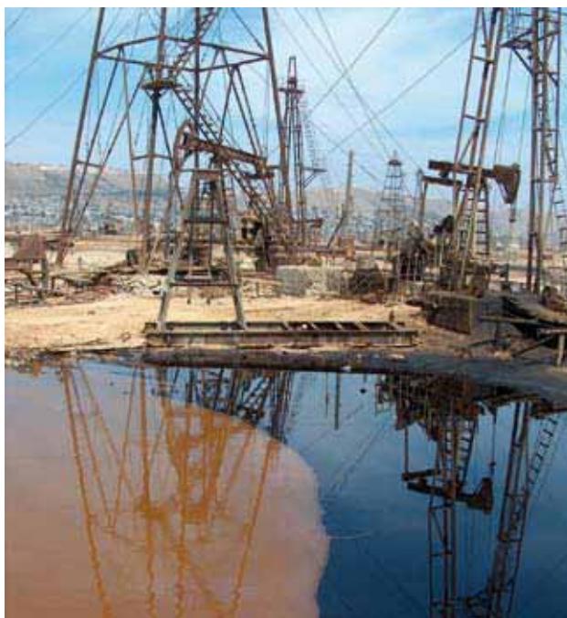
Area of Bibiejbat in Azerbaijan.

In November 2008, the OSCE Office in Baku supported the introduction of the Green Pack environmental educational toolkit in the Nakhchivan Autonomous Republic. In a training course delivered by the Baku-based NGO “For Sustainable Development”, a group of thirty Nakhchivan State University professors and students