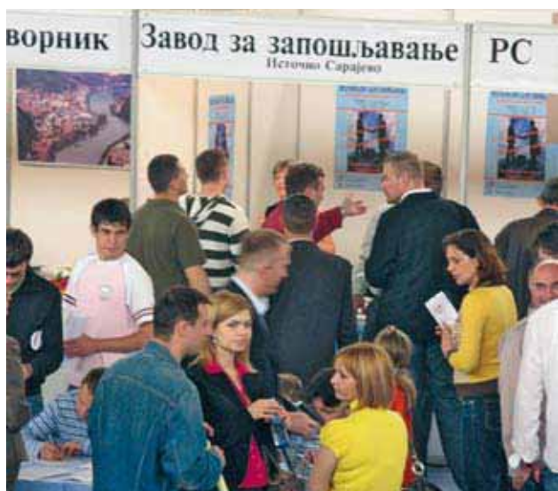
Employers interact with potential employees at a job fair organized by the OSCE and local partners in Zvornik, Bosnia.

Lenkoran. Based on previous needs assessment and in co-operation with regional partners, the Office provided consultancy services in the fields of production, marketing and financing of SMEs. For that purpose, the Office organized a regional workshop for private businesses from southern Azerbaijan. In addition, SMEs from both Economic Zones were addressed directly through fifteen outreach training sessions. All events combined, the Office managed to provide assistance to more than 400 representatives of private entities. The events provided a platform for dialogue between the private sector and relevant State institutions, regional authorities and state-sponsored support funds.