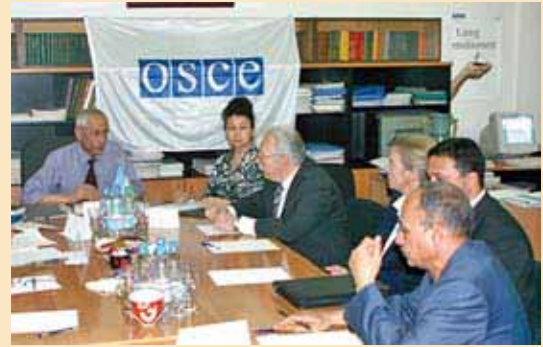
OSCE Ambassador Istvan Venczel attends an arbitration session at the Arbitration Centre in Tashkent.

Another successful example of the OSCE's close collaboration with the local NGO Legal Problems Research Centres is demonstrated in a project finalized by the end of 2008. Starting in 2007, the OSCE Project Co-ordinator's Office in Uzbekistan supported national efforts to establish arbitration courts as alternatives to commercial dispute resolutions. In association with the NGO, the OSCE offered legislative and information