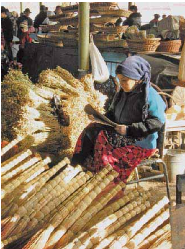
Woman on a market in Tashkent.

Since many years, the OSCE Project Co-ordinator in Uzbekistan is actively involved in improving the socio-economic development and helping the Government to create employment in rural areas. In partnership with the Farmer's Association of Uzbekistan around 450 farmers have been trained since 2007. The training curriculum comprises of a business development module, but also pays attention to environmentally-friendly business methods and agro-technology know-how. Co-operation in the framework of this project continued in 2008 with advanced capacity-building on financing and credit schemes, taxation and the efficient and environmental-friendly use of chemicals in agriculture. In addition, training round tables for almost 250 farmers were held in seven regions. This programme will be continued and strengthened in 2009 with a focus on the establishment of three pilot information centres in Ferghana, Karshi and Urgench.