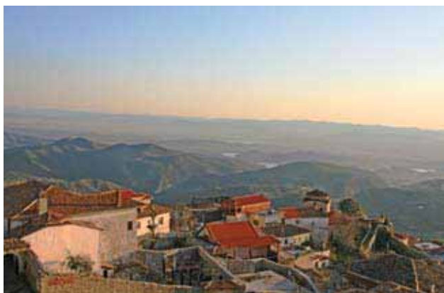
View from Kruja to Tirana.