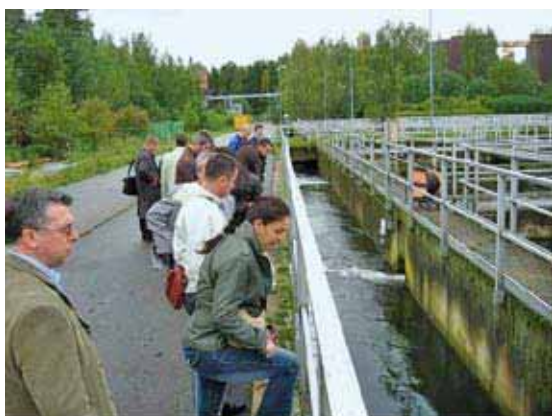
Participants of study tour examine waste water plant.

In recent years, Albania has seen unprecedented levels of economic growth, fuelled particularly by investments in the infrastructure and energy sectors. This has led to a stronger awareness of the need to ensure that the details of these investments are shared with local communities as part of the wider planning process and that decision making processes should be transparent. In co-operation with the Ministry of Environment, the OSCE Presence in Albania is supporting efforts to encourage public participation in environmental decision-making in line with international standards. In September 2008, government and civil society representatives examined local public participation methodologies during a study visit to Finland. Participants were introduced to best practice in all sorts of participatory planning – from bicycle lanes to water treatment plants. The “lessons learnt” have contributed to further Government and civil society efforts to increase public engagement in the policy planning process.