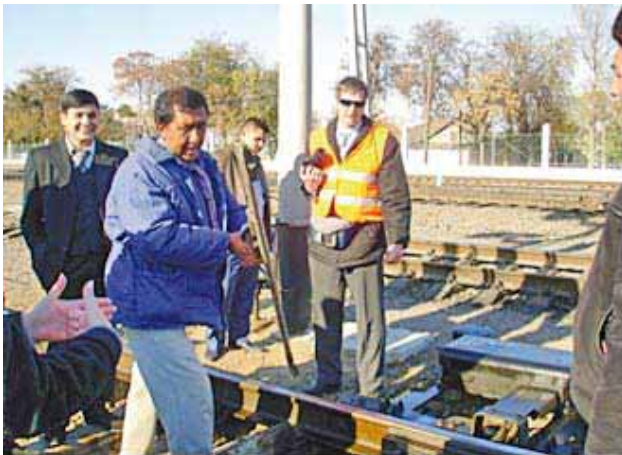
Participants assess the status quo of Turkmen railway infrastructure.

The OSCE Centre in Ashgabad in co-operation with the OCEEA and with the substantial support of the Austrian Federal Railways set up two workshops, which aimed at sharing international best practices and technical expertise in the areas of railway safety, infrastructure planning, operations and maintenance. Fifteen employees from the Ministry of Railway Transport - engineers, technical operators and maintenance workers - participated in both workshops. Participants were also informed on risk management, safety procedures and technical maintenance by experts from the Austrian Federal Railways.