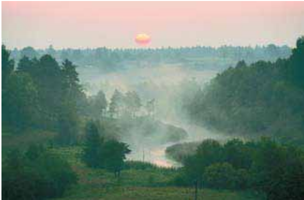
Forest in Belarus. (Anatoli Kliashchuk)