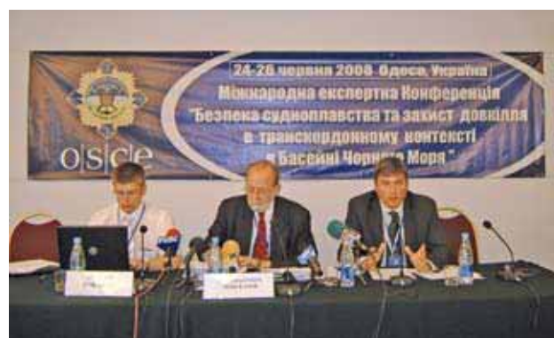
OSCE Conference in Odesa.

Activities addressing a number of these challenges are already ongoing in the region but participants con-