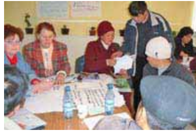
Activities in the Aarhus Centre in Osh, Kyrgyzstan.

populations' ecological rights through the third principle of the Aarhus Convention Access to justice. With these aims in mind, the Centre is implementing various activities: trainings and seminars for civil societies on the principles of the Aarhus Convention, trainings on the conducting of public hearings for the areas facing ecological problems, roundtables and meetings for the government and nongovernmental organizations to improve dialogue between State authorities and public sector in addressing environmental related issues. Besides, the Centre is promoting public access to information via producing and distributing newsletters, shootings of video films on different ecological topics and the installation of information boards.