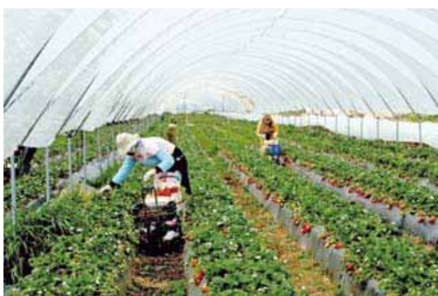
Moroccan migrants working in the agricultural sector in Spain.

tion management and its linkages with economic, social and environmental policies to the benefit of stability and security in the OSCE region". Two meetings of the Forum were scheduled to take place on 19-20 January 2009 in Vienna and on 18-20 May 2009 in Athens. Following this decision, the Greek Chairmanship and the OCEEA engaged in the preparatory process. The EEC continued to play an important part in the 16th EEF process, with this subject being discussed at virtually every EEC meeting.