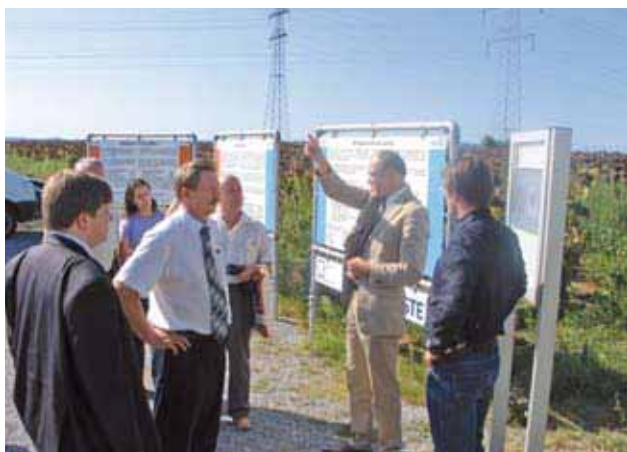
An expert at the Energy Park Bruck an der Leitha explains various methods of energy generation.

Efficiency in Central and Eastern Europe, in Minsk, on 6-7 October 2008. The programme, implemented in co-operation with the Austrian Energy Agency, outlined the European and the Austrian energy landscape, its focus on renewable energy sources and energy efficiency policies. On site visits to show best practices in the industrial and housing/building sector, were organized such as at the Biomasse Kraftwerk Simmering, the Energy Park Bruck a/a Leitha and at the European Centre for Renewable Energy in Güssing.