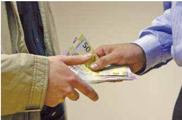
Corruption is a stumbling block on the way to democracy and progress. It can jeopardize the success of long-term initiatives in any area of development.

The purpose of the regional workshop was to facilitate capacity building of the national criminal justice systems in Central Asia. The primary goal was to improve national and international legal co-operation and information exchange between the investigative agencies and central authorities. The workshop focused on enhancing the co-operation between the authorities from Central Asian countries and other source and destination countries involved in the laundering of illegal proceeds and the financial manipulation of proceeds from crime. Participants were experts who were directly involved in criminal justice co-operation to combat the laundering of illegal proceeds or who dealt with the identification, freezing, seizure and return of the proceeds of crime.