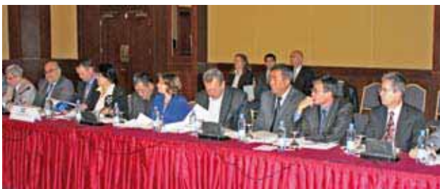
High level representatives at the Water Workshop in Tashkent.

The OSCE Project Co-ordinator in Uzbekistan, together with the OCEEA and their implementing partner, the Scientific Information Centre of the Interstate Commission for Water Coordination (SIC ICWC) organized a workshop on “Environmental Security and Safety – A major factor of water management”. The workshop was attended by high-level representatives from the Ministry of Agriculture and Water Management, the State Nature Protection Committee, the Ministry of Reclamation and Water Resources of Uzbekistan and additional sixty senior representatives from the water management sector of all Central Asian States. As a result of the event, several recommendations were formulated, such as the need for a strengthening of organizational structures in the management of trans-boundary water basis and better collaborative mechanisms to satisfy the needs of upstream and downstream countries concerning the usage of hydro-energy resources. Moreover participants agreed on the relevance of harmonized water legislation, ecological norms and standards in the Central Asian States.