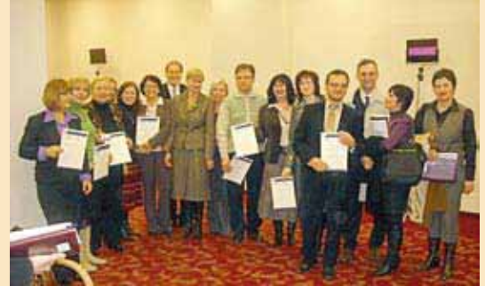
A group of school board trainers at the concluding State-level conference in Bosnia.

are often selected and appointed on the basis of political criteria. In order to support transparent and operationally independent school boards, the OSCE Mission piloted a training programme in Zenica-Doboj Canton, with the support of the Cantonal Ministry of Education. Twenty-five trainers were trained, who in turn held 36 workshops. The programme will be extended to other parts of the country in 2009.