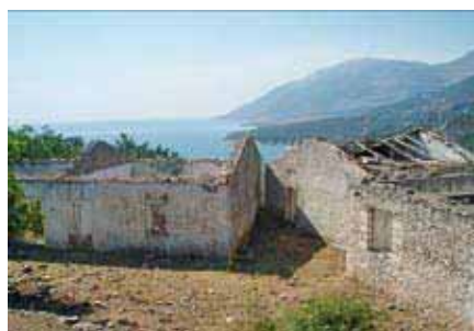
Property disputes undermine sustainable development of the Ionian coastline.

The OSCE Presence in Albania is currently implementing an immovable property registration project along the country’s Ionian Sea coast. Since 1991, property ownership of this area with great economic potential has become highly disputed, causing significant strife and thus preventing the development of the area’s tourist potential. The aim of the property registration is to provide the legal status of immovable property so that a clear title of ownership can be issued. Clearly, this title is a pre-requisite for long term sustainable economic development in the area. The registration process, which aims at including more than 70,000 properties, also provides a mechanism through which property disputes can be resolved.