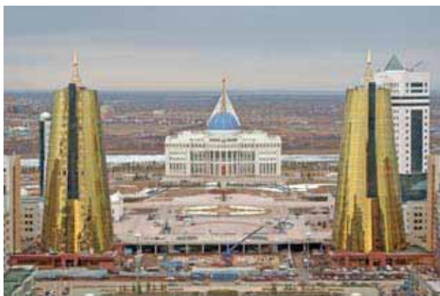
A view of Astana looking towards the Presidential Palace.

On 5-6 May 2009, in Astana, the OCEEA together with the OSCE Centre, the WCO and the Customs Committee of Kazakhstan organized a Seminar on Strategic Anti-corruption Methods in the Customs Field: Sharing International Best Practices . The meeting gathered around 90 national participants, including the