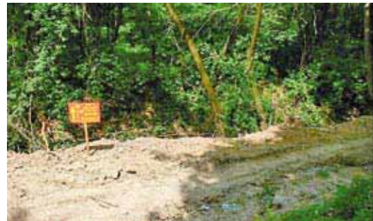
Supported by the OSCE, local communities and municipalities in Ugljevik cleaned illegal garbage dumps.

During the reporting period, several Youth NGOs from Bratunac and Srebrenica, with support from the Mission, implemented a pilot project in the eastern part of the country to promote volunteerism, improve links between the municipalities and youth activists and raise the level of environmental awareness. The project included a workshop on volunteerism and a related initiative to clean the bank of the River Drina.