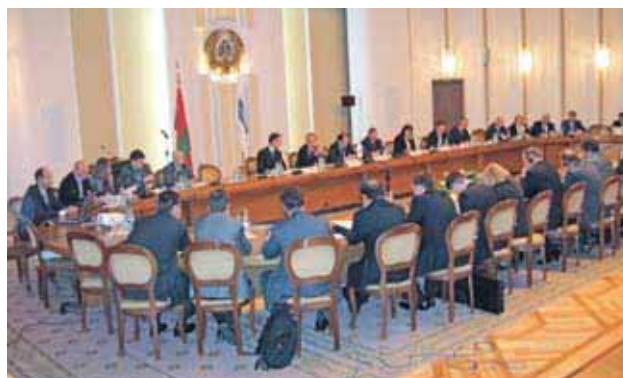
Workshop on Energy efficiency in Minsk.

2008, the OSCE Office in Minsk successfully brought together key experts and policy makers from Central and Eastern Europe as well as from specialized organizations. The conference which offered an excellent opportunity for the sharing of expertise and experience was attended and co-organized by the Belarusian Department for Energy Efficiency and supported by the Ministry for Foreign Affairs.