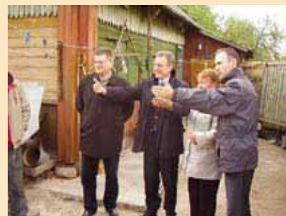
The OSCE Head of Office and the OSCE Economic and Environment Programme Manager visit a farm in Slavgorod district in which the OSCE promotes agro-business development.

Starting in 2008 and in partnership with the “Slavgorod Fund”, the OSCE Office in Minsk initiated a project aimed at improving the livelihood of the young population in the region affected by the nuclear accident in Chernobyl. The Programme focuses at the promotion of youth entrepreneurship in rural areas and was created by local experts, family businesses and Belarusian local administration.