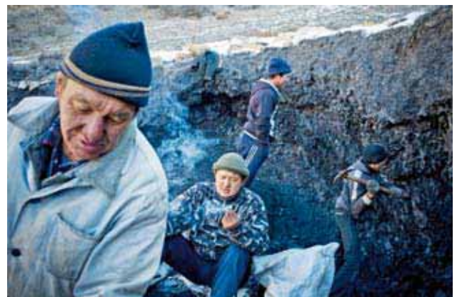
Workers at a coal mine in Min-Kush, Kyrgyzstan.

The Government's policies target towards domestic employment creation for youth and vulnerable population groups living in economically depressed areas,