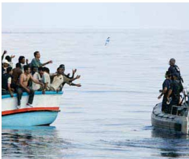
Rescue operation in the Mediterranean Region.

Organization on Migration and the International Chamber of Commerce, as well as State agencies, institutes and universities from Cyprus, France, Switzerland and the United States took part in the conference.