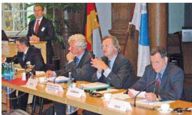
Participants at the Conference in Berlin which launched the “ Investment and Competitiveness Initiative for Central Asia ”.

In co-operation with the OECD, the OCEEA organized a ministerial-level conference that launched the “ Investment and Competitiveness Initiative for Central Asia ”. The initiative seeks to attract investment, improve the business climate and enhance competitiveness in Central Asia, Afghanistan and Mongolia. The Conference was hosted by the German Ministry of Economics and Technology and took place in Berlin in November 2008.