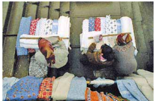
Women selling fabrics in Uzbekistan.

Consistent with its mandate, the OCEEA supports economic empowerment and the development of attractive investment and business climates as means to create economic opportunities and to strengthen democratic and market principle in countries of transition. In particular in these times of the global financial and economic crisis, these activities gain even more importance.