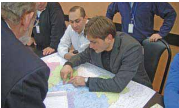
The Environmental Damage Assessment Team prepares for its mission.

In August 2008, at the request of Georgia, the OSCE organized with UNEP a joint technical mission to assess the environmental impact of the conflict in Georgia. During the armed conflict in August 2008 a number of forest fires occurred as a consequence of military activities in several regions of the country. The Joint OSCE/UNEP Mission took place from 29 September to 3 October 2008 and was led by the Co-ordinator of OSCE Economic and Environmental Activities and the Director of the UNEP Regional Office for Europe. The Mission aimed at listening to the widest possible range of views on the environmental impact of the conflict and at providing recommendations for remediation of identified environmental issues, including possible confidence-building measures.