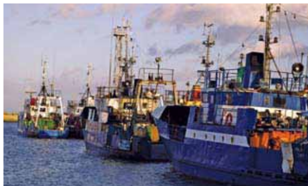
Seaport in Poland. (Maciej Tamkun)

The Sixteenth Economic and Environmental Forum cycle, focusing on “ Maritime and inland waterways co-operation in the OSCE area: Increasing security and protecting the environment ”, concluded at the second part of the Forum which took place on 19-21 May 2008 in Prague.