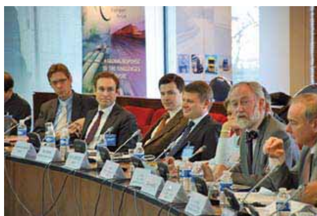
Participants of the seminar on Overcoming Border-Crossing Obstacles in Paris on 6 March 2009.

On 5-6 March 2009, in Paris, the OCEEA, contributed, upon invitation, to a joint International Transport Forum (ITF), UNECE, World Bank Seminar on Overcoming Border Crossing Obstacles . The OCEEA representative gave a presentation on “OSCE efforts aimed at facilitating legitimate cross-border trade and transport operations across its region”. On the margins of the seminar various side-meetings with representatives of the OECD, ILO, WCO, the World Bank and other relevant organizations took place.