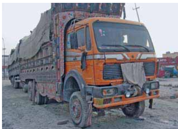
Truck in Afghanistan.

Within the framework of the MC Decision on OSCE engagement with Afghanistan (MC.DEC/4/07), OCEEA has contributed to the OSCE package of 16 projects proposals implementing this Decision. These projects, which have been designed and will be implemented in co-operation with World Bank and World Customs Organization focus on the development of trainings for Afghan Customs officials and Tajikistan Customs, in order to promote common practice at Tajik /Afghan