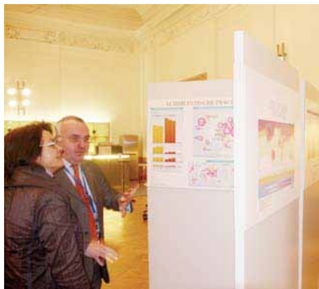
In the course of the Vienna conference, participants enjoyed the Special Event: Presentation of the Maps on Migration (from the “Atlas des Migrations” co-edited by La Vie - Le Monde), followed by a discussion.

Further to these recommendations, participants discussed the issue of data harmonization, which proves essential for the formulation of migration policies. In this regards, the OSCE and IOM explored future fields of co-operation in assisting participating States.