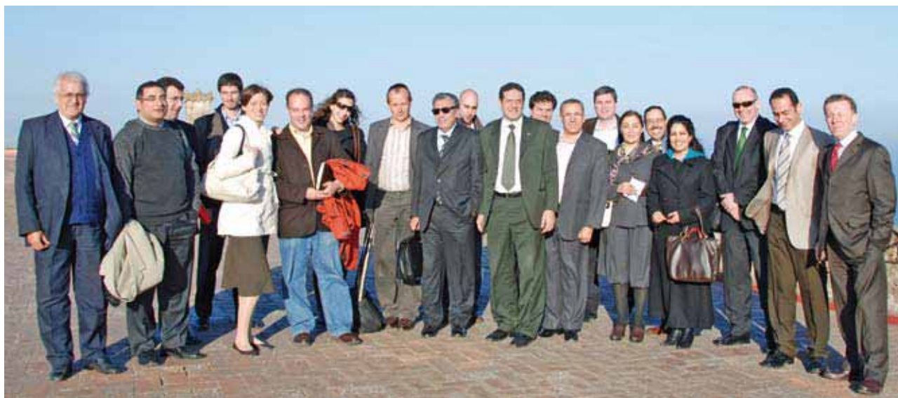
Expert's Workshop on Environment and Security Issues in the Southern Mediterranean.