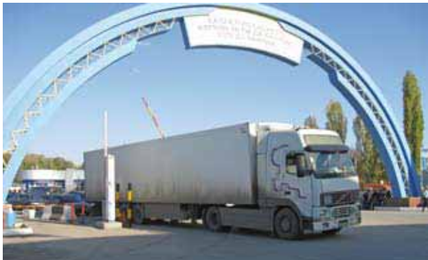
A large truck at the Ak-Jol/Korday border crossing point between Kazakhstan and Kyrgyzstan.

In May 2008, the OCEEA, jointly with the UNECE and in co-ordination with the CPC Borders and the Action Against Terrorism units, started the development a Handbook of Best Practices at Borders . Through the promotion of existing border-crossing best practices in the field, the Handbook's main purpose is to assist OSCE participating States, particularly landlocked countries with limited access to world markets, in developing more efficient border, transit transport and customs policies.