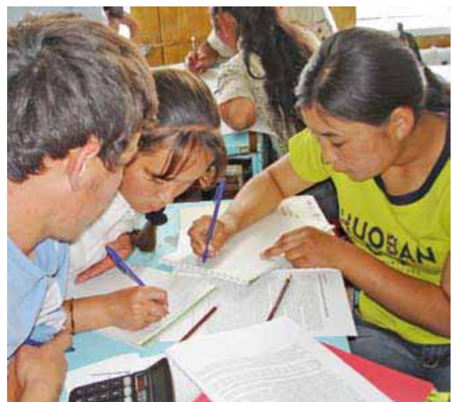
Youth entrepreneurship in Kyrgyzstan.

Improving the investment climate is a priority for the Kyrgyz Government and crucial for the country’s further economic development. The OSCE Centre in Bishkek works closely with central and regional Governmental authorities to increase their capacity in the promotion of investment opportunities. Among other activities, the Centre provided trainings for Government authorities and assistance in the development of information resources. Consequently, so-called “Investment Consultancy Centres” were opened in four villages in the