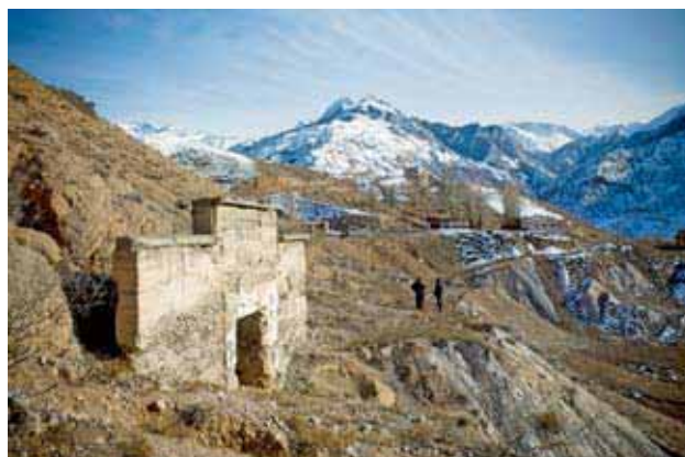
Entrance to the former Uranium mine in Min Kush village, Kyrgyzstan.