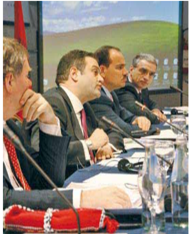
The Greek Chairmanship opens the 2 nd preparatory Conference in Tirana.

The Tirana Conference brought together over 180 participants, with different backgrounds and affiliations, who engaged in a stimulating discussion.