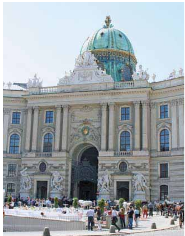
The first part of the 17 th Economic and Environmental Forum took place in Vienna.