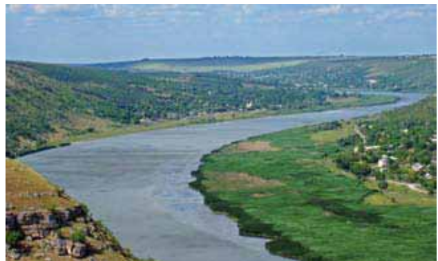
View over the Dniester River. The OCEEA and the UNECE Environment and Human Settlements Division supported a project to facilitate an agreement between the two riparian States to the Dniestr River - Ukraine and Moldova, including the Transdnestr region - on how to develop co-operation on integrated water resource management in the Dniestr River basin.

In this connection, it was stated that the development of a Handbook on Best Practices at Border Crossings would be a natural consolidation and extension of the OSCE engagement to-date. The OCEEA, jointly with the UNECE Secretariat, made a project proposal (No. 1100727) to develop a handbook of best practices to assist the participating States, in particular the landlocked countries and their transit neighbours, in developing more efficient border and customs policies.