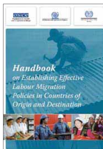
Handbook on Labour Migration Management. (OSCE/IOM/ILO)

The OCEEA continued to promote the dissemination and use of the OSCE-IOM-ILO Handbook on Establishing Effective Labour Migration Policies in the OSCE area and among the OSCE Mediterranean Partners for Co-operation.