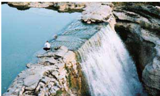
River Cijevna in Podgorica, Montenegro. (Jovan Nikitovic)