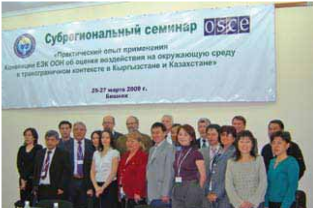
Environmental Impact Assessment Meeting in Bishkek.

governmental Organizations have a key role to play in the implementation of the EIA Convention.