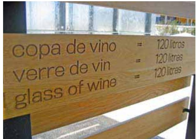
To produce a glass of wine it is necessary to use 120 liters of water. Participants to the study visit learned that and other facts at the EXPO Zaragoza 2008.

From 1 to 6 July 2008, the OCEEA organized in cooperation with the Spanish Ministry of Foreign Affairs and Co-operation, the Spanish Ministry of Environment, Expo Zaragoza 2008 and the Chamber of Com-