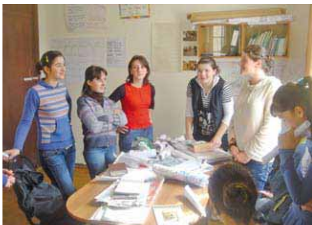
Eco-club members in Georgia.