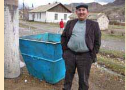
The OSCE provided the first garbage container in 8 years to Naryn City.

In the area of toxic and radioactive waste the OSCE Centre in Bishkek initiated a health campaign to inform citizens of the southern towns of Sheftaftar and Sumsar about potential health hazards and possible protective measures. To this effect,