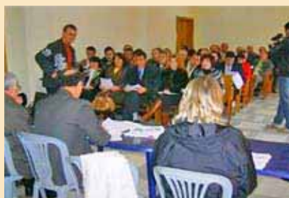
Citizens participating in community development planning in Permet, Albania.

In the context of Albania's decentralisation process, the Government in Tirana has made considerable efforts in promoting good governance and democratic practices at the local level. By aiming at further strengthening respective policies, a joint programme, entitled " Local Government Leadership Benchmark Programme ", was implemented by the OSCE Field Presence and the Council of Europe. The Programme was implemented in five pilot municipalities and was targeted at mayors and administration staff. It was meant to help the local