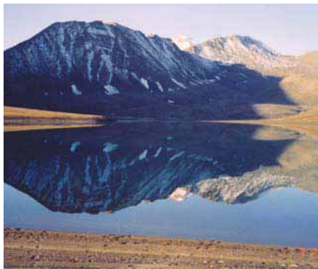
Keli lake in Georgia.

region. Particularly noteworthy, ENVSEC partners completed its sixth and final year of support to cooperative transboundary river monitoring between the riparian States of the river basin.