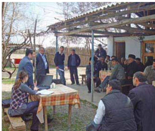
ALAC workshop in Azerbaijan (Transparency International Azerbaijani Chapter).

during a conference in Tirana, which was held in October 2008. The conference concluded that the joint programme had proven to be an important catalyst in the fostering effective municipalities' leadership, strategic management of public services and in increasing citizens' participation. Following the successful example and steered by guidelines that were published in the course of the pilot period, the project continued in 2009 with three of the initial municipalities focusing on performance management and budgetary planning mechanisms.