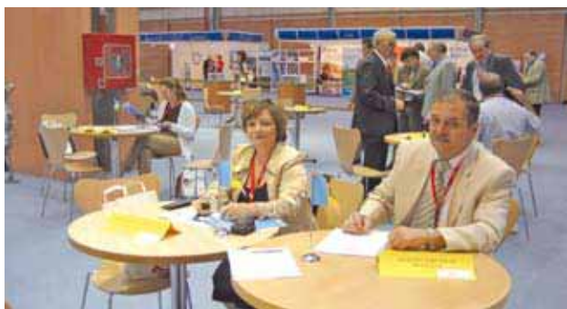
Experts from Chisnau and Tiraspol at the Water Expo in Zaragoza, Spain.