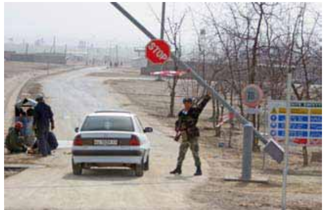
A checkpoint leading to a new Tajik border customs terminal, near a bridge over the river Piandj on the Tajik-Afghan border.

In this regard, on 1-3 October 2008, in New York, the Senior Economic Adviser represented the OCEEA at