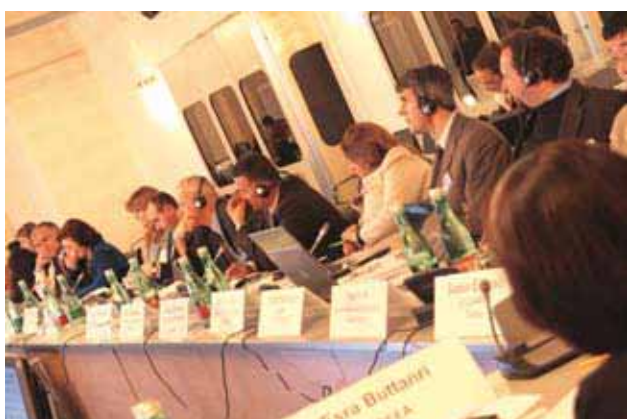
Participants of the Aarhus Centres Meeting engaged in pro-active discussions and elaborated on the “Road Map for Aarhus Centres”.

The OSCE continued to respond to the capacity building needs, particularly in implementation of the third pillar of the Convention. The High-Level Judicial Workshop on Access to Justice in Environmental Matters for the South-Eastern Europe organized jointly by the OSCE and the UNECE in Tirana, on 17-18 November 2008 has been highly instrumental in this respect.