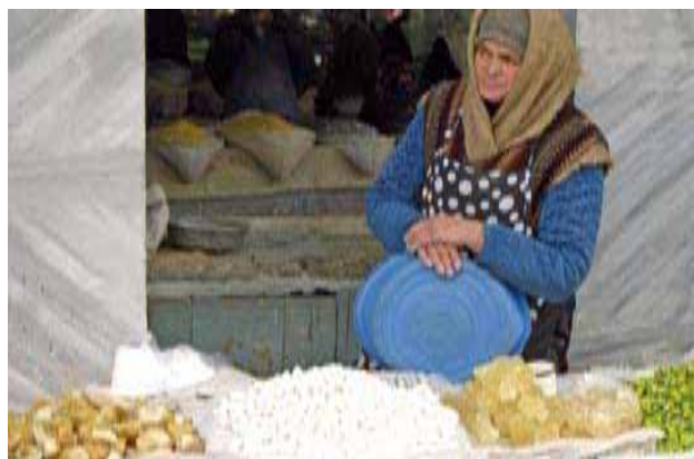
Woman selling agricultural products in Uzbekistan.

In 2009, the Uzbek Committee for Agriculture, Water Management and Environment of the Oliy Majlis (Parliament) and the Ministry of Agriculture and Water Management of the Republic of Uzbekistan, strive towards strengthening the agricultural sector within the country's economy. As a reaction to this endeavour, the OSCE Project Co-ordinator in Uzbekistan has initiated