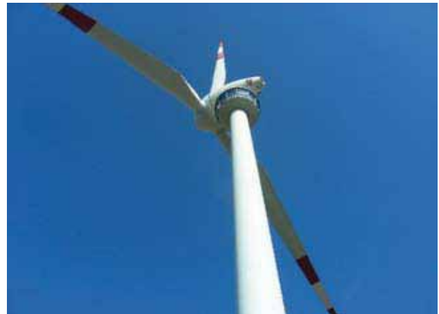
Windmill in the Energy Park in Bruck an der Leitha, Austria.

On the basis of the Ministerial Council Decision on “Energy security Dialogue in the OSCE” adopted in 2006, the OCEEA has further developed co-operation with competent international organizations (e.g., the International Energy Forum, International Energy Agency, Secretariat of the Energy Charter, International Atomic Energy Agency, European Commission, EBRD, Eurelectric, Eurogas).