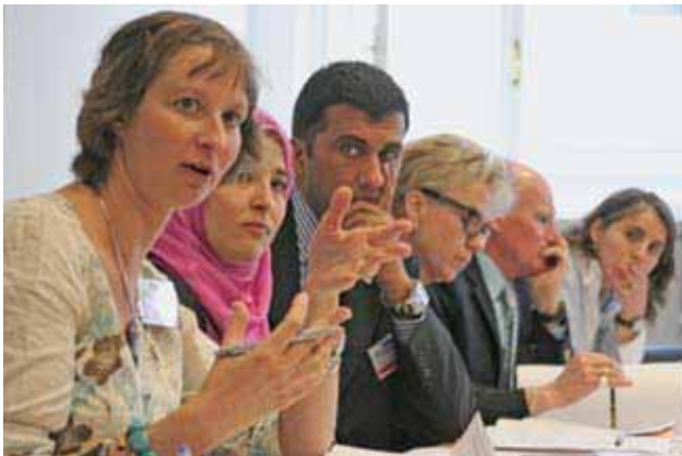
Vienna Expert Meeting on Training Materials, 21 April 2009.

Two regional training of trainers workshops are planned in 2009 to be held in Albania and Kyrgyzstan. The training manual is being produced in Arabic, English and Russian.