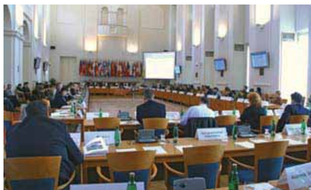
Participants listening to a presentation in the first preparatory Conference in Prague.

countries and regions. Therefore, effective migration management can only be sustained through partnerships and co-operation between destination, transit and origin countries, both bilaterally as well as at the regional and international levels. The OSCE could in particular help in stimulating political will as it is well placed to provide a platform for continued dialogue on how to strengthen co-operation towards effective migration policies and practices.