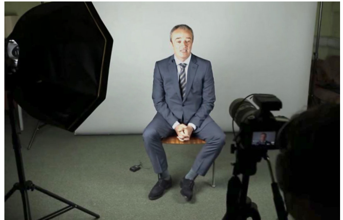
Films are produced as part of the campaign to raise awareness of more effective approaches to preventing and countering violent extremism.

The OSCE's 57 participating States and 11 Partners for Co-operation are determined to prevent and combat terrorism, in all its forms and manifestations, while upholding human rights and the rule of law. But we need everyone on board to make it happen. Let's speak up together loud and clear for peace and security!