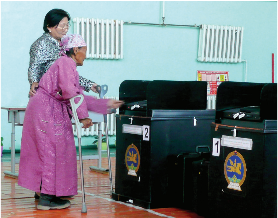
Voter in Mongolia receiving assistance to the ballot box.

Terminology related to persons with disabilities is evolving, and there is not always agreement among different organizations and persons with disabilities themselves about which terms to use. While there are some terms that are generally seen as outdated and having negative connotations, it is often not clear what the best language to use is. To ensure that the language chosen is appropriate, it is always best to ask persons with disabilities or their representative organizations for advice. Legal instruments and guiding principles developed by persons with disabilities, such as the UNCRPD or International Language Guidelines on Disability, developed by the International Foundation for Electoral Systems, could also be used for this purpose.