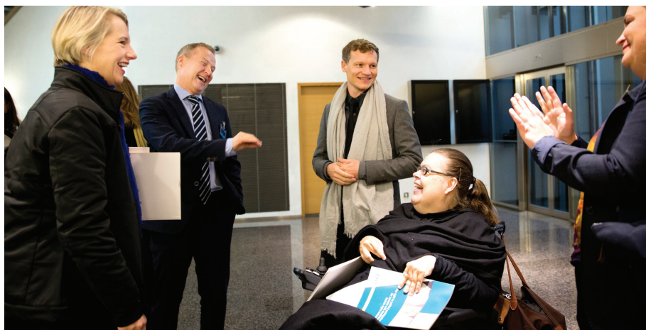
Participants at an ODIHR organized high-level seminar on strengthening participation of persons with disabilities in political and public life, Helsinki, 31 October 2016

Similarly, people living in institutions may be less able to take an active role in their societies than those living in the community. Also, a lack of quality inclusive education often limits a person's ability to fully reach her or his potential and participate in political life. It is important to recognize the connection between various rights when working to ensure the full participation of persons with disabilities in political and public life.