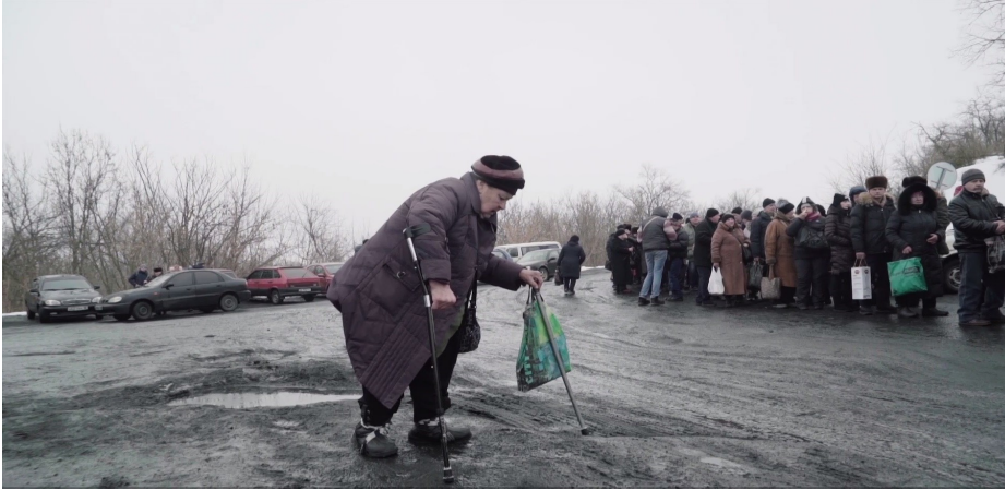
Woman close to the entry-exit checkpoint near Stanytsia Luhanska, Luhansk region