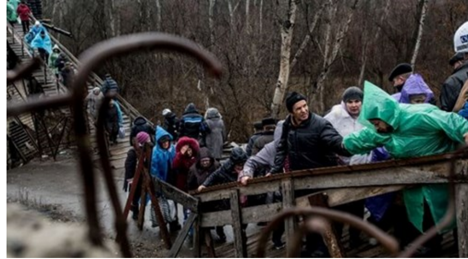
Civilians crossing the destroyed Stanytsia Luhanska bridge in Luhansk region